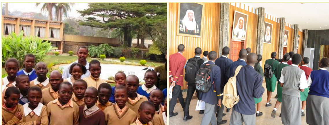
Schools visiting The National Assembly

Bookings can be made by calling the Office of the Chief Serjeant-at-Arms on +254 (0) 020 2848000. Alternatively, you can approach Security officers at the Gates Receptions for information and booking.