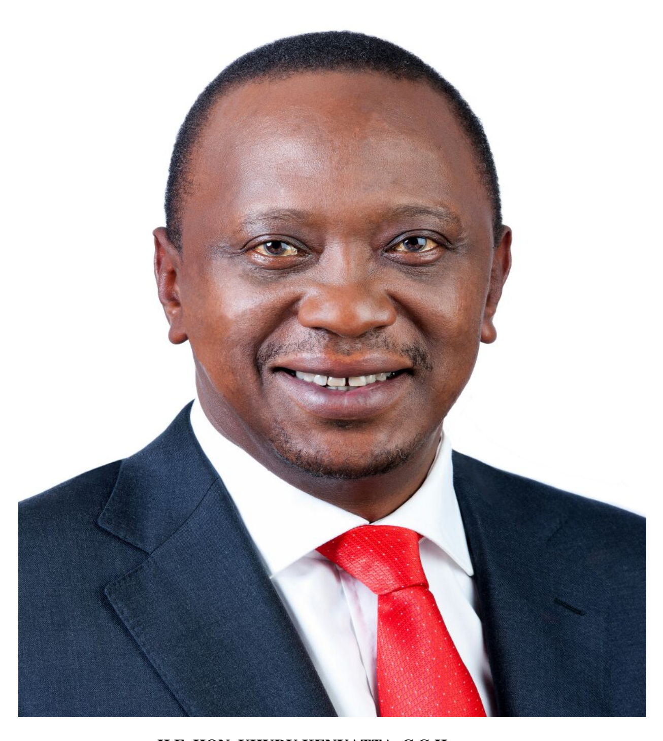
H.E. HON. UHURU KENYATTA, C.G.H. President of the Republic of Kenya and Commander-in-Chief of the Defence Forces