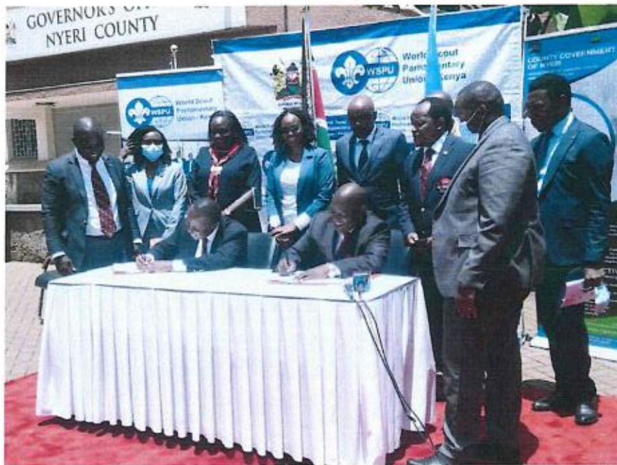
Members of WSPU Kenya and Nyeri County Governor during the MOU signing

The MOU was signed in February 2021 in Nyeri County. WSPU Kenya has plans of setting up the Baden Powell Centre of Excellence and the County Government will provide the required land to set up this joint project.