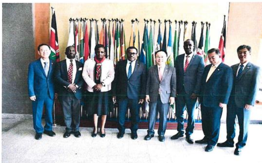
Members of WSPU Korea with the Speaker of the Senate, Hon. Kenneth Lusaka, EGH, MP, Sen. Petronilla Were and Sen. Ltumbesi Lelegwe.