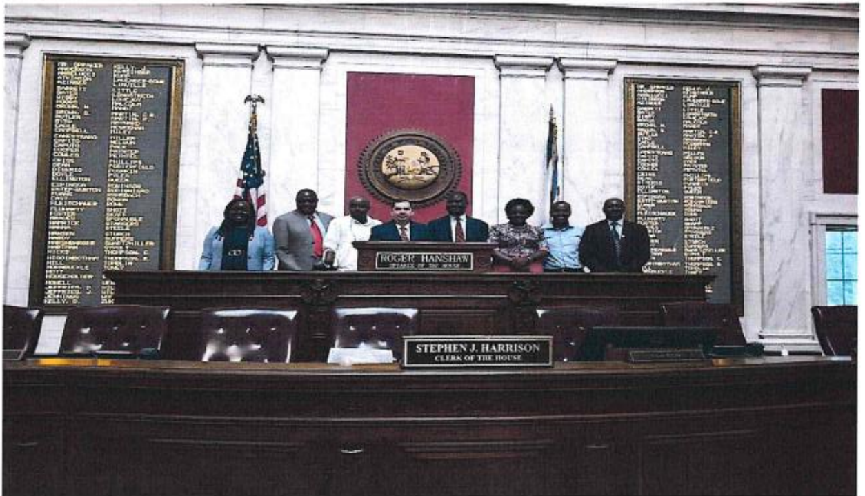
WSPU Kenya delegation at the West Virginia Legislature

The delegation also had an opportunity on the sidelines of the Jamboree to benchmark with their counterparts from at the West Virginia Legislature.