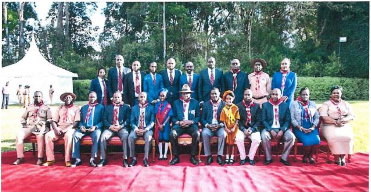
Members of WSPU Kenya with H.E. President Uhuru Kenyatta, CGH during their visit to State House

As per the Constitution of the Kenya Scouts Association which is an act of Parliament, the President of the country automatically becomes the patron of the Association.