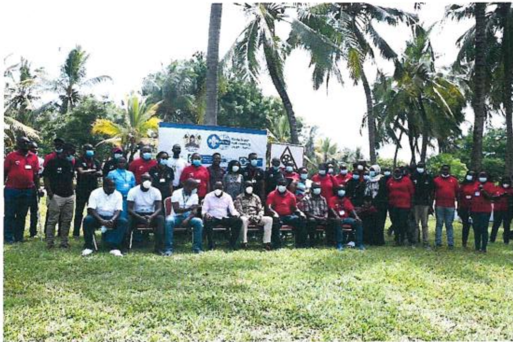
WSPU Induction in Mombasa in 2020 with the Deputy Speaker of the National Assembly, Hon. Moses Cheboi, CBS

The induction was attended by Members of Parliament, Members of County Assemblies, and County executive Committee members in Charge of Youth. During the Induction members were briefed on the WSPU programmes and plans for the following year.