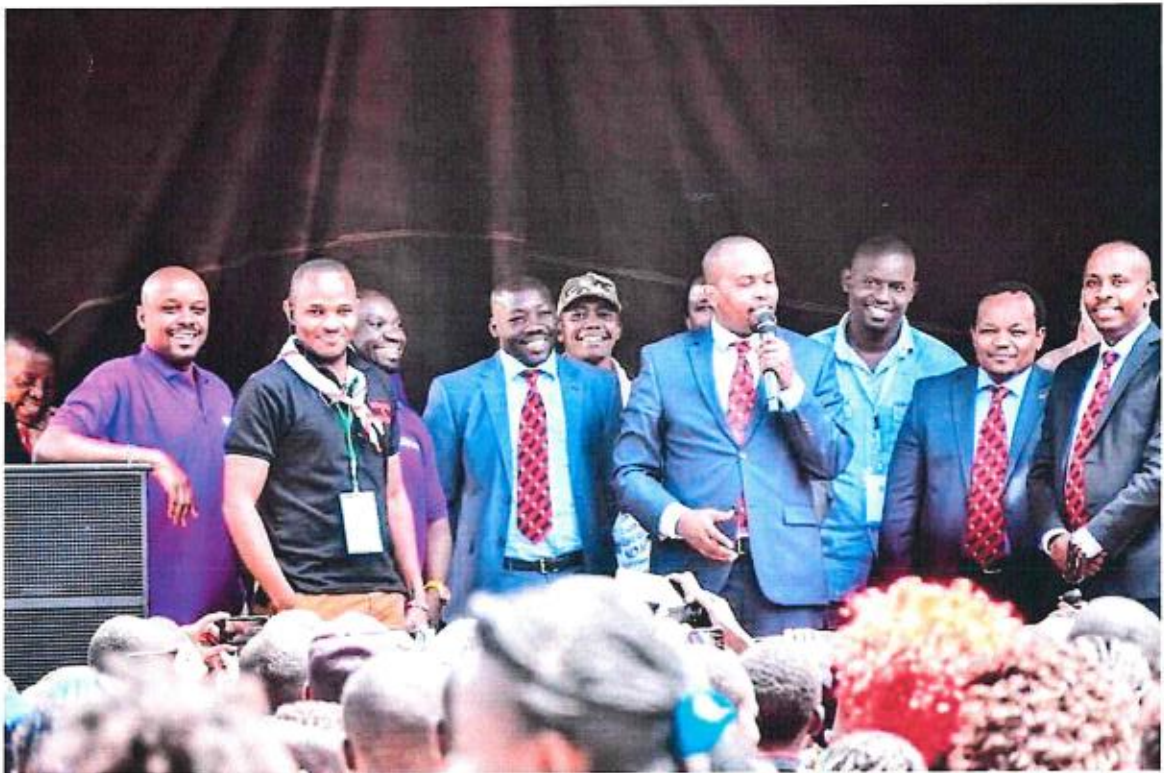
Members of WSPU at the Kenya Scouts Association during the inaugural meeting of the Caucus