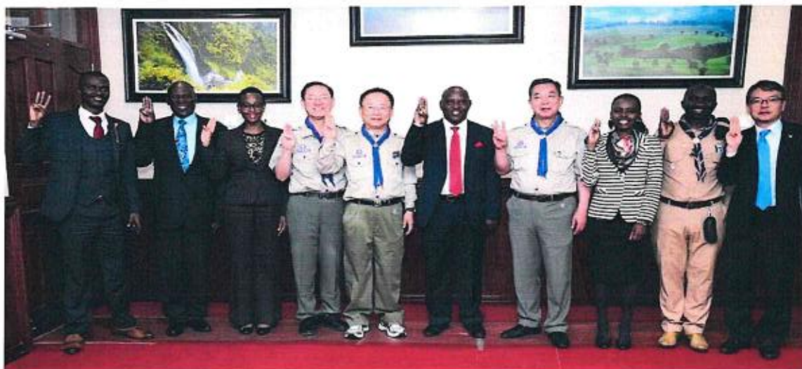
Members of the WSPU Korea with the Governor of Nyeri County H.E. Mutahi Kahiga

The team also visited the proposed WSPU Africa Assembly venue in Nyeri and met the Governor of Nyeri H.E. Mutahi Kahiga who also assured them of the County Government of Nyeri's support.