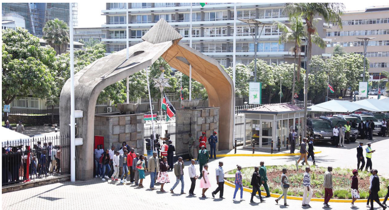
Members of public queue to view the body of The Late President HE Daniel Torotich arap Moi