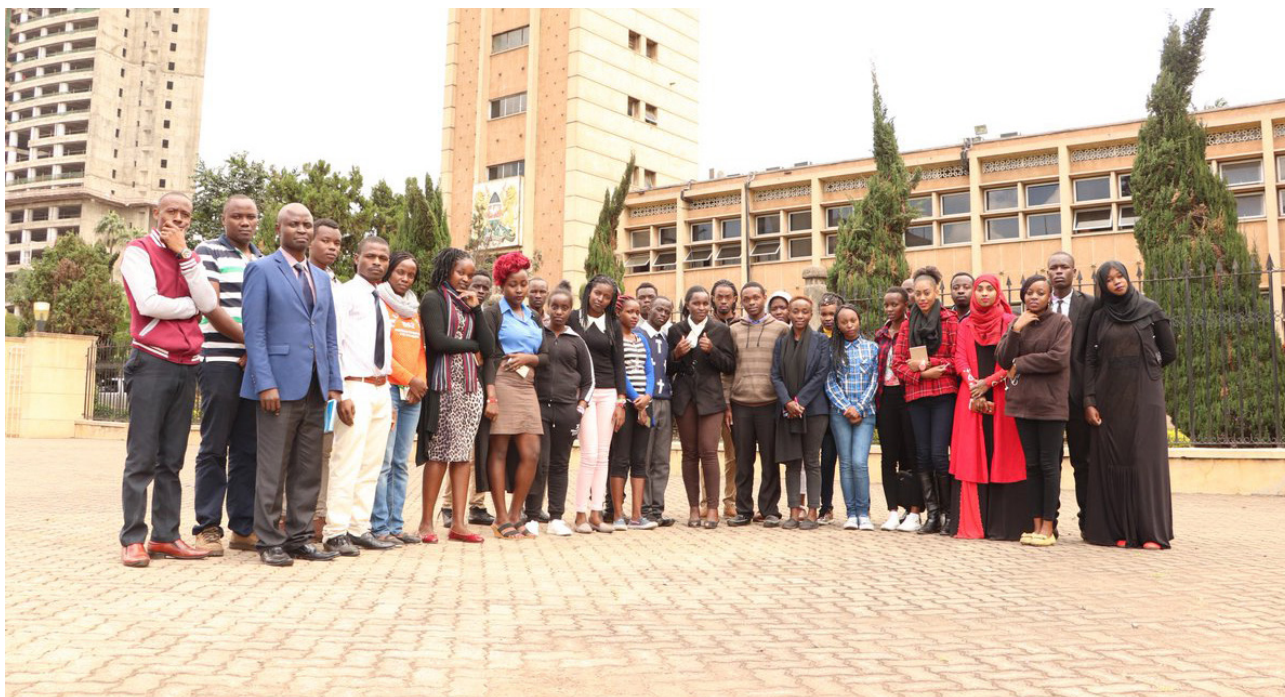
Above: A group of university students tour the Parliament Building on an open day. Below: A group of Primary School students attend a session of The National Assembly;