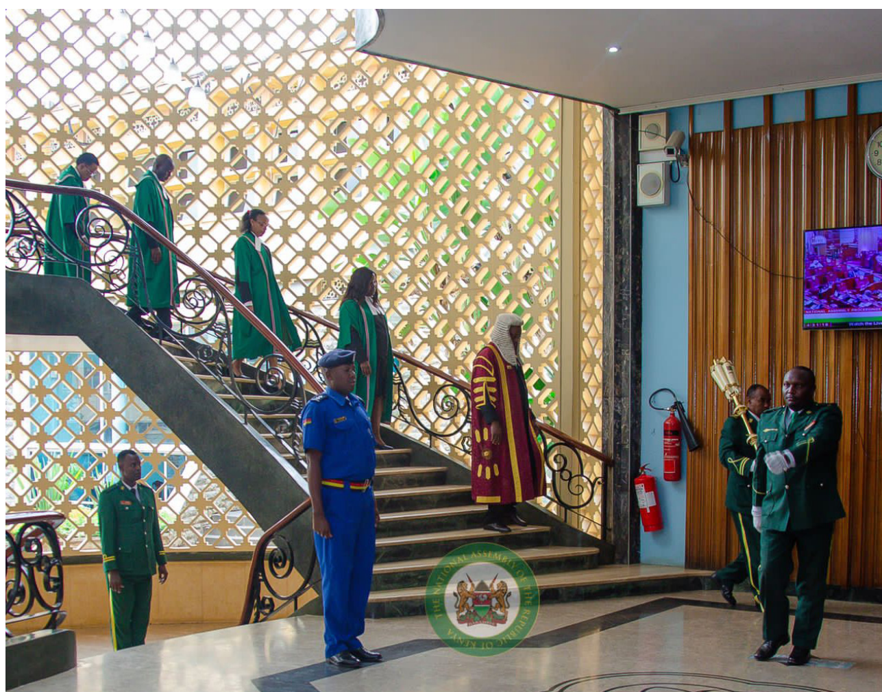
Procedural Clerks ( in green gowns behind the Speaker) in the Speaker's procession before the commencement of a House Sitting.