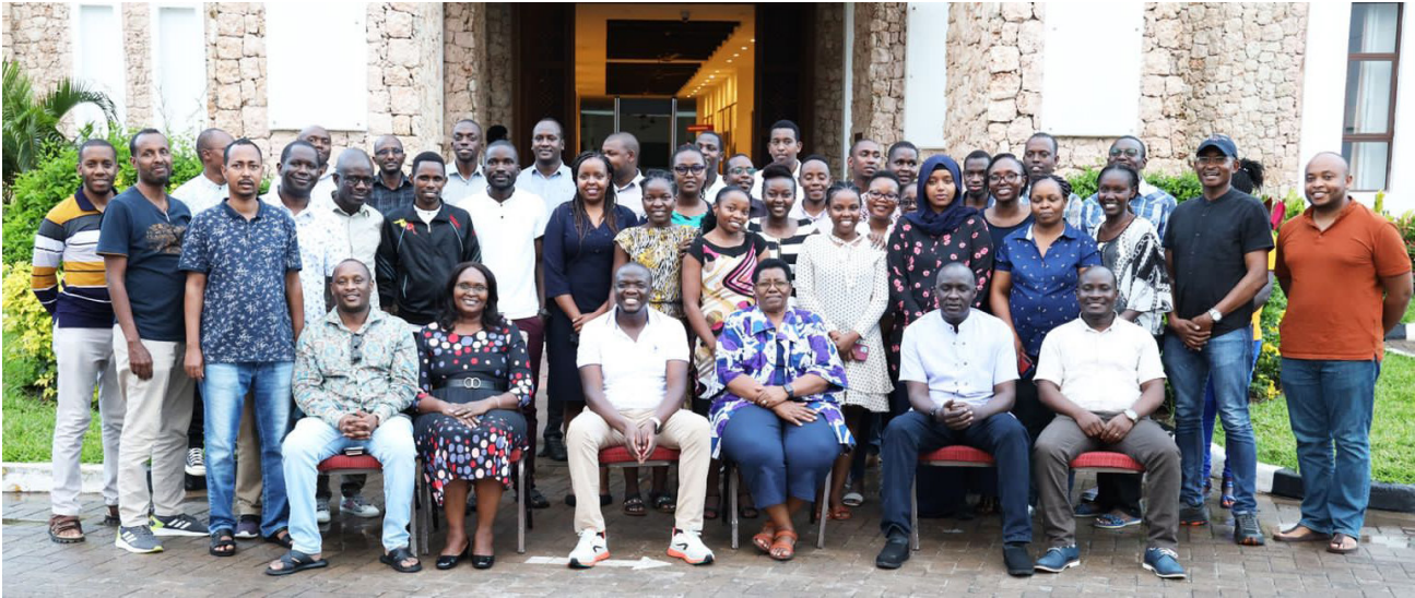
Officers from the Parliamentary Budget Office during a past retreat in Mombasa