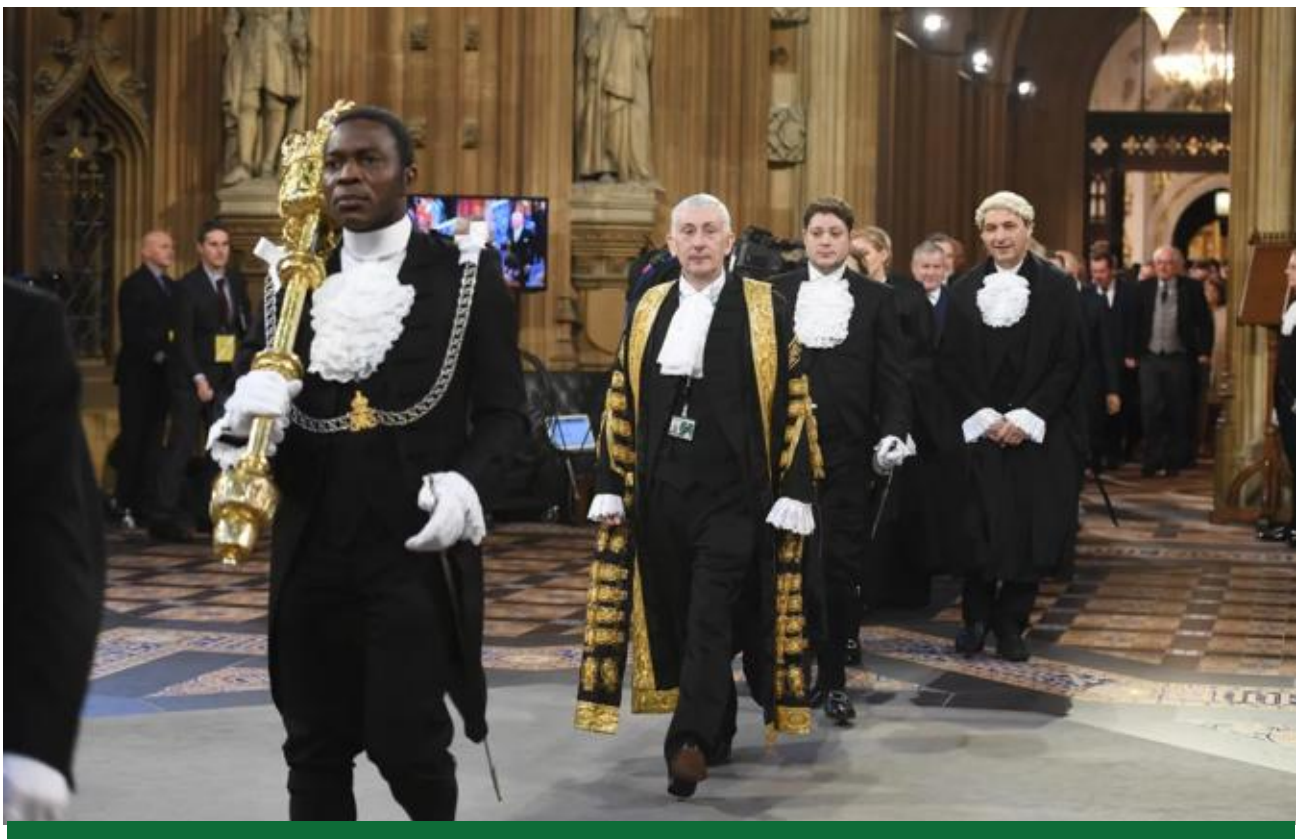
House of Commons Speaker's Procession entering the Chamber led by The Serjeant at Arms (UK Parliament)

Also, a Member of the House of Commons may be expelled from the House and this has been treated as one of the methods of punishing a Member.<sup>2</sup>