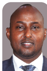
The Hon. Junet Mohamed, CBS, MP Minority Party Whip