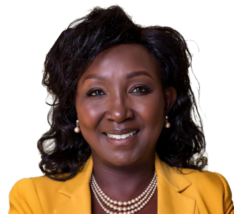
Hon. Gladys J. Boss, MGH, MP Deputy Speaker of the National Assembly