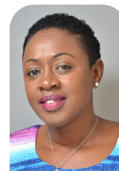
The Hon. Sabina Chege, CBS, MP Deputy Minority Whip