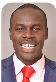
The Hon. Silvanus Osoro, CBS, MP Majority Party Whip