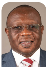
The Hon. Owen Baya, CBS, MP Deputy Leader of the Majority Party