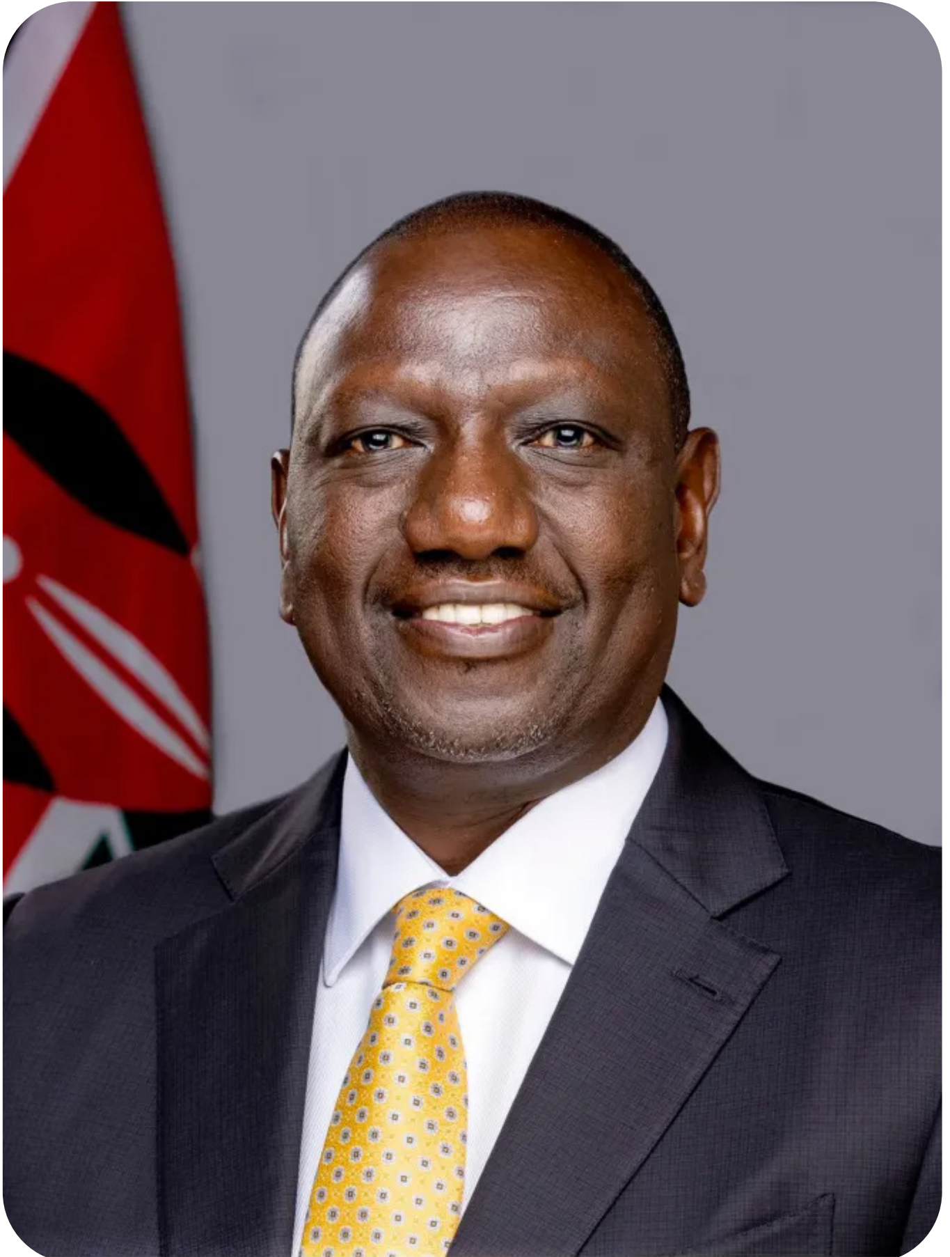
His Excellency Hon. William Samoei Ruto, PhD., C.G.H. President of the Republic of Kenya and Commander-in-Chief of the Defence Forces