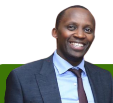
Samuel Njoroge Clerk of the National Assembly