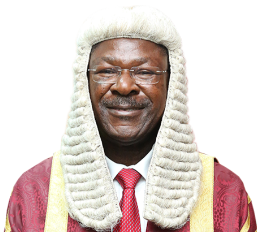
Rt. Hon. Moses M. Wetang'ula, EGH, MP Speaker of the National Assembly & Chairperson PSC