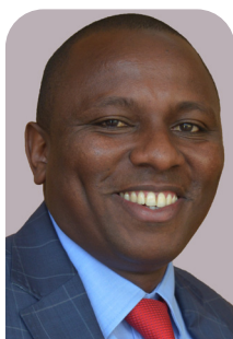
The Hon. Kimani Ichung'wah, MGH, MP Leader of the Majority Party