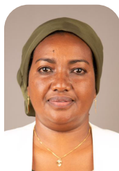
The Hon. Naomi Jillo Waqo, CBS, MP Deputy Majority Whip