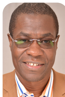
The Hon. Opiyo Wandayi, MGH, MP Leader of the Minority Party