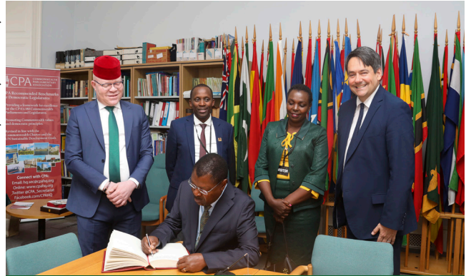
National Assembly Speaker Rt. Hon. (Dr.) Moses Wetang'ula signs a visitor's book during a courtesy call to Hon. Stephen Twigg, the CPA Secretary General in his office at the CPA headquarters, London.

Members who accompanied the speaker during to this courtesy call confirmed that such engagements have notably sharpened their skills in articulating Parliamentary matters especially for those who are serving their first time in parliament.