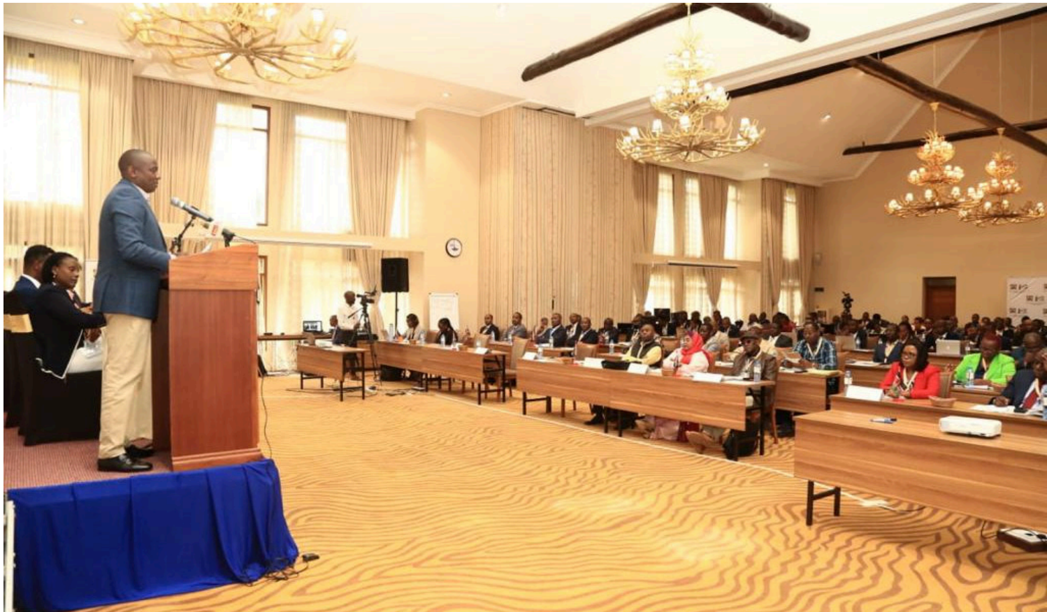
The Leader of the Majority Party , Hon. Kimani Ichung'wah MP, addressing delegates during the opening ceremony of the Third Annual Parliamentary Symposium