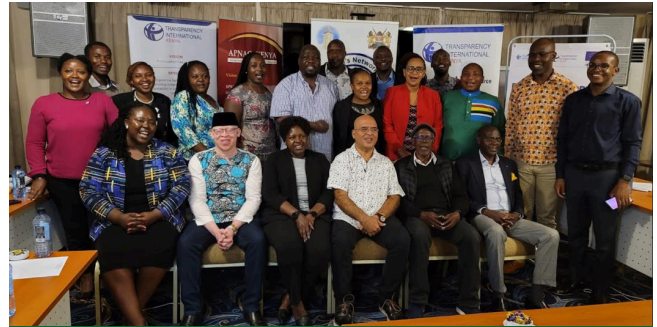
Newly elected officials of APNAC Kenya and outgoing ones pose for a photograph after picking the organisation's leadership during an exercise held at a Nakuru hotel recently.