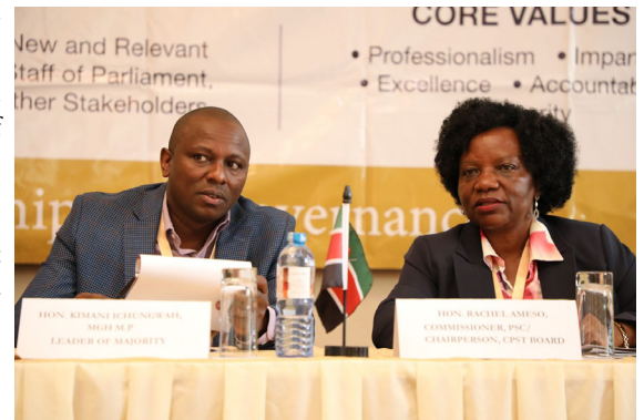
The Leader of the Majority Party in the National Assembly Hon. Kimani Ichung’wah confers with the Chairperson of the CPST Board and PSC Commissioner, Hon. Rachael Ameso during the opening session of the Third Annual National Parliamentary Symposium hosted by CPST in Naivasha.

Speaking on behalf of the Secretariat of the Parliamentary Service Commission the Secretary to the Commission and Clerk of the Senate, Mr. Jeremiah Nyegeye emphasized the significance of public participation in shaping legislation and influencing decision-making processes, including the agenda and priorities of legislatures. He added that public participation is a vital catalyst for fostering public trust in institutions including the legislature. The citizenry values inclusion and transparency in the conduct of public affairs.