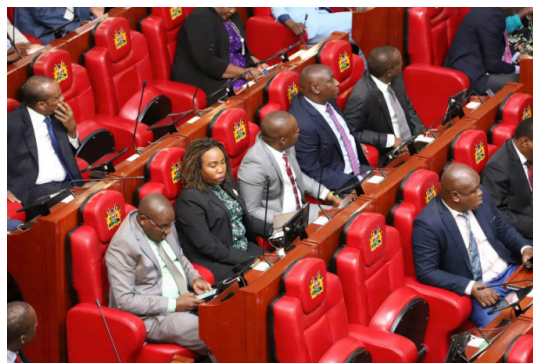
File photo : Members of the National Assembly during a sitting of the House.

He appreciated the fund's contribution towards improving security and infrastructure; through the establishment of police posts, and the creation of laboratories in areas where they were previously lacking