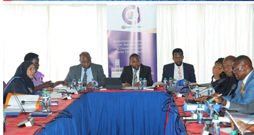
The Senate Committee on Information, Communication and Technology led by Trans Nzoia Senator Allan Chesang during the meeting with the Cabinet Secretary in the Ministry of Information, Communication and Digital Economy, Honorable Eliud Owalo.