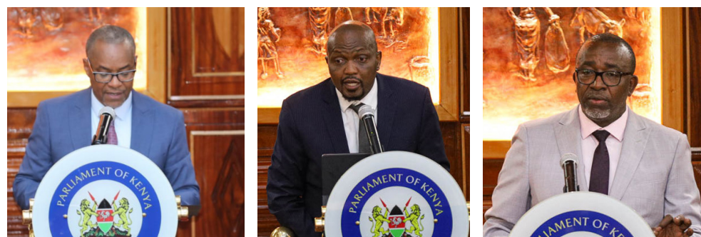
From left: Lands, Public Works, Housing and Urban Development Mr Zacharia Mwangi Njeru; Hon. Moses Kuria, Cabinet Secretary for Investment, Trade and Industry; and Hon. Mithika Linturi, Cabinet Secretary for Agriculture and Livestock Development, when they appeared before the Senate last week.

He was also asked to explain how many companies have so far imported goods what actions the minister intended to take against