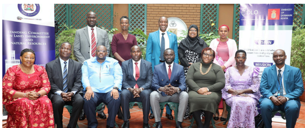
Senate Committee on Land, Environment and Natural Resources Chaired by Nyandarua Senator John Methu (right) during deliberations with a delegation from International Development Law Organization (IDLO)

Senator Methu said the discussions and pursuit of a perspective of the rule of law approach for achieving transformative climate action were timely. "We continue to witness adverse and far-reaching implications on the well-being and welfare of our