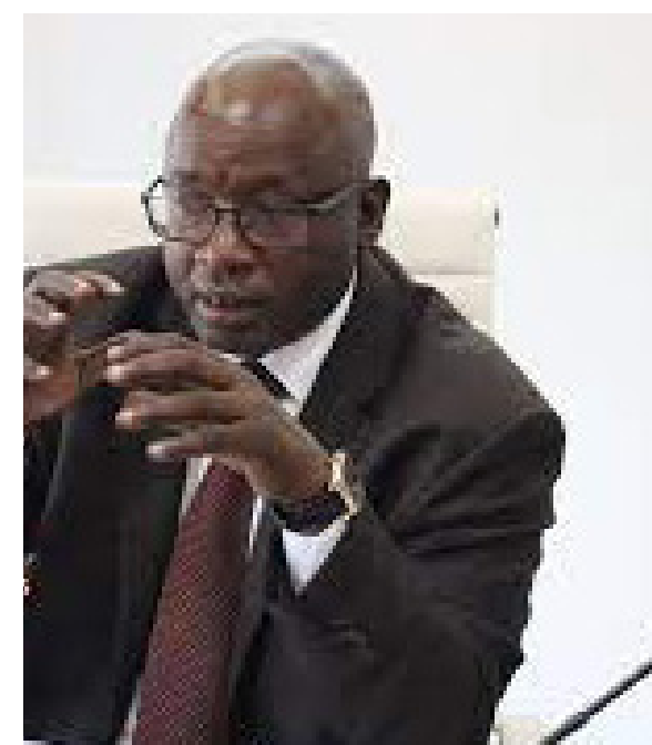
Seneta William Cheptumo, Mwenyekiti wa Kamati ya Kudumu ya Usalama wa Kitaifa, Ulinzi na Mashauri ya Kigeni kwenye Bunge la Seneti

Anasema licha ya nyongeza ya asilimia 12 kutolewa kwa wafanyakazi mnamo mwezi Mei, 2022 kwa lengo la kuwasaidia kukabiliana na kupanda kwa bei ya bidhaa muhimu kama chakula, mfumuko wa bei uliopo sasa bado umefanya gharama ya maisha kusalia juu na hivyo kunapaswa kuwepo na mikakati ya kuwasaidia Wakenya.