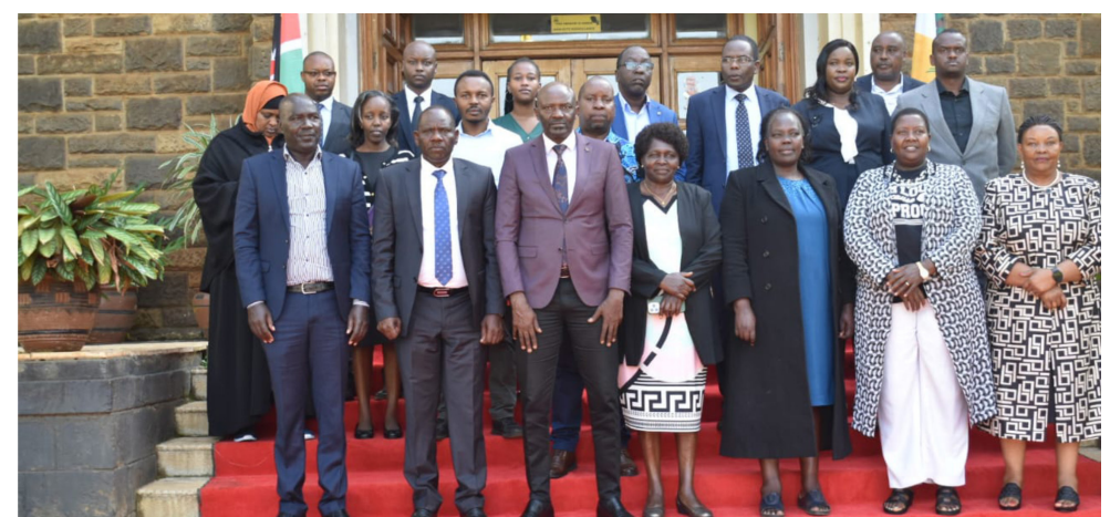
Senate Education Committee during the tour of special needs schools in Uasin Gishu County.

Arising from the visit, the Committee noted the following challenges: