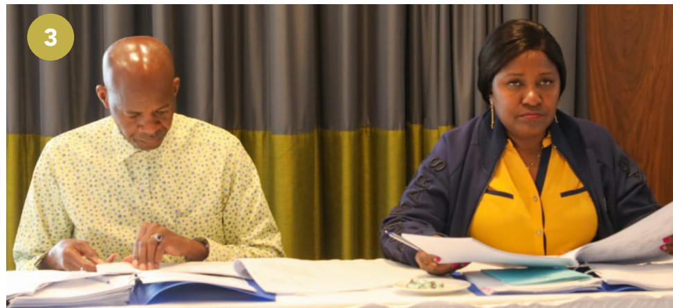
Members of the Agriculture, Livestock and Fisheries Committee during a session.

undertaken by the Coffee Research Institute under the Kenya Agricultural