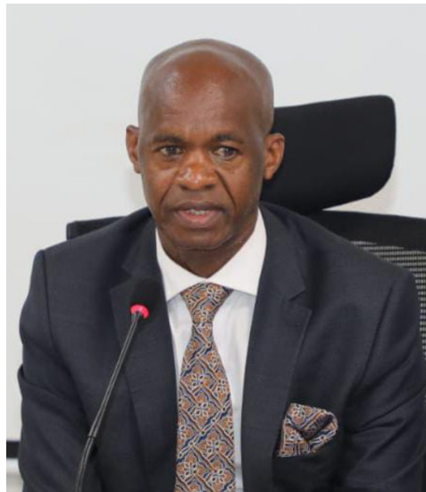
Members of the Senate Committee on Agriculture.

the Governor and the Cabinet Secretary to appear before them on June 20th, 2023 and further requested them to formally submit on the petition. The Committee had started investigations into the alleged graft at the West Kano