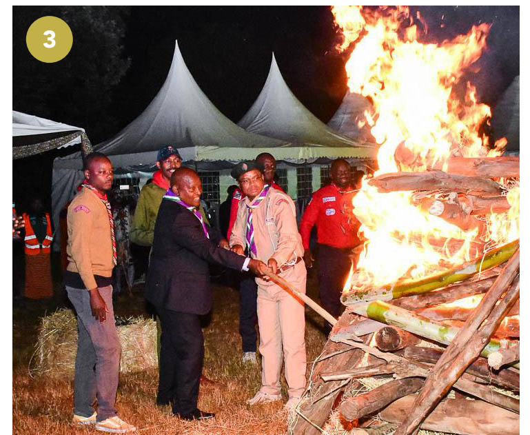
Senate Speaker Amason Jeffah Kingi unveils a statue of Lord Baden Powell, the founder of the Scouts Movement during the WSPU Assembly at Kagumo Teachers Training College on Friday, June 23, 2023. 2. Speaker Kingi addresses delegates, when he officially closed the Assembly on Friday June 23, 2023. 3. Speaker Kingi lights the symbolic bonfire.

Climate Change Mitigation Through Scouting" for the main assembly. The WSPU Africa Youth Assembly, that ran concurrently with the main assembly had the theme: Refocusing Towards Youth Empowerment and Action for Climate Change,