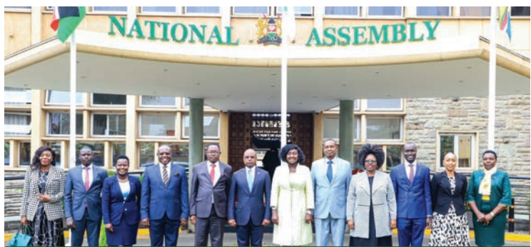
Newly elected Members of the Executive Committee of the Commonwealth Parliamentary Association (CPA) Kenya branch, pose for a photo with Senate Speaker Hon. Amason Kingi and National Assembly Deputy Speaker Hon. Gladys Boss