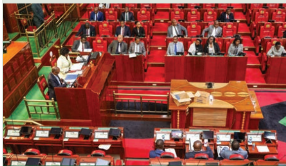
The CPA-Kenya AGM presided over by Hon Senate Speaker Amason Kingi and Hon Deputy Speaker Gladys Boss.

The Commonwealth Parliamentary Association exists to promote knowledge of the constitutional, legislative, economic, social and cultural aspects of parliamentary democracy, with particular reference to the countries of the Commonwealth. It offers a vast opportunity for legislators and legislative staff to collaborate on issues of mutual interest and to exchange good practices. Parliamentary democracy, with particular reference to the countries of the Commonwealth. It offers a vast opportunity for legislators and legislative staff to collaborate on issues of mutual interest and to exchange good practices.