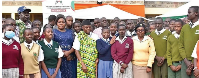
Hon. Samuel Moroto posing for a photo with students, parent and county leadership during the launch of the NG-CDF bursaries programme at Kapenguria Constituency Office.

Hon. Samuel Moroto (Kapenguria) launched NG CDF Bursaries Programme at the Kapenguria Constituency Office. The over Kshs.31 million-kitty will benefit 1,317 students in tertiary institutions and 5,020 students in secondary schools.