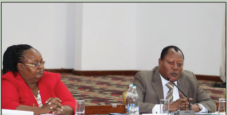
The Committee on Implementation Chairperson Hon. Raphael Wanjala (right), and Vice Chairperson Hon. Rose Museo following deliberations during the meeting with the Ministry of Lands and NLC officials