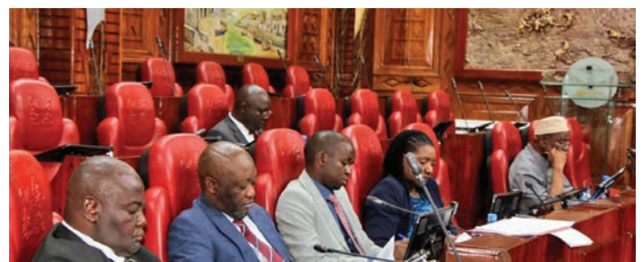
Members of the Committee on Lands scrutinizing documents during a meeting with the State Department on Lands

the State Department has historical legal pending bills amounting to Kshs.18.236 billion which resulted from non-payment for judgment settlements over the years.