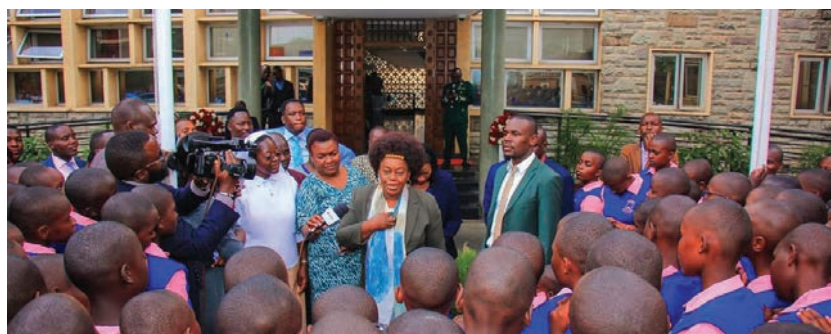
Tabaka Girls teachers and Class 8 pupils were all smiles when they toured Parliament Buildings for learning and exposure. Hon. Silvanus Osoro, Hon. Milly Odhiambo, Hon. Dr. Rachel Nyamai and Hon. Donya Toto, gave the girls a word of encouragement as they prepare to sit for their final examination.