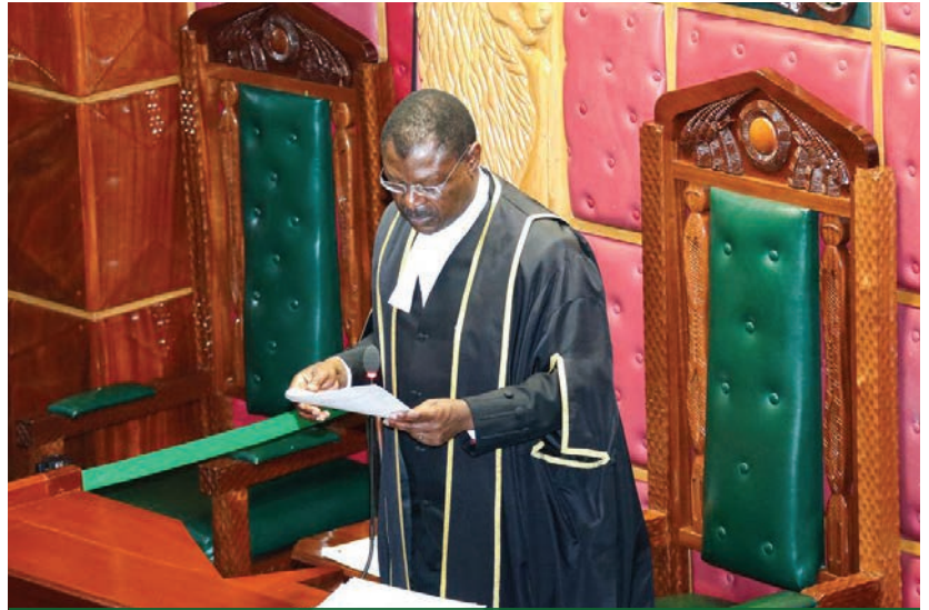
The Speaker of the National Assembly the Rt. Hon. (Dr.) Moses Wetang'ula issues a Communication to the House in a previous sitting.

While delivering the Communication from the Chair, the Speaker further called on the two Committees to bear in mind the requirements of Article 24 of the Constitution on the limitation of rights, and the various court verdicts that have been issued regarding the application of the Bill of Rights.