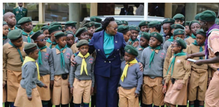
Students from Njunu Primary School in Githunguri Sub-county pose for a photo with their area MP, Hon. Gathoni Wamuchomba during a visit to Parliament.