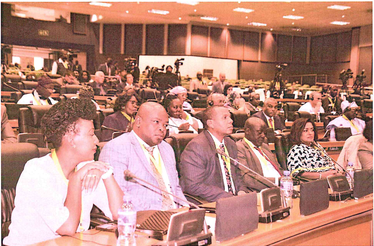
Members of the Delegation keenly follow proceedings during the Climate Change Summit (held on 16 th & 17 th May, 2023) where H.E. President (Dr.) William Ruto, CGH, Commander-in-Chief of Kenya Defense Forces, was the Chief Guest