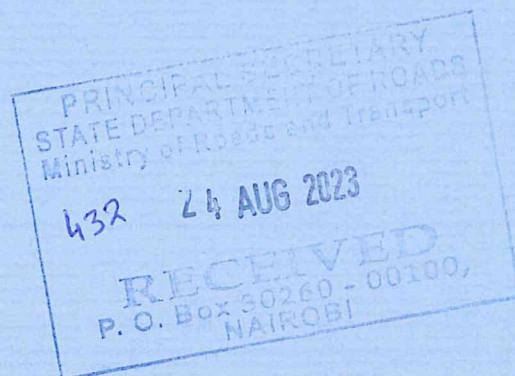
Hon. Kipchumba Murkomen, EGH CABINET SECRETARY