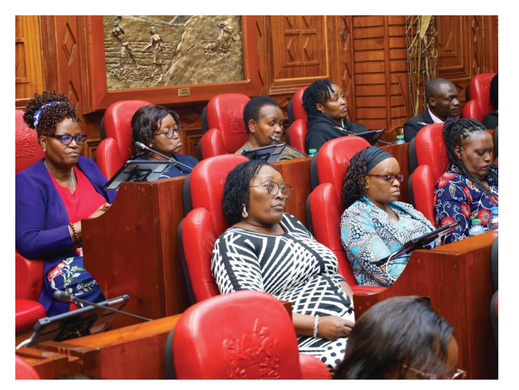
Some of the victims of the '98 bomb blast in Nairobi and relatives when they appeared before the Senate Committee

The Committee acknowledged that the compensation of the victims is long overdue and pledged to ensure they're compensated.