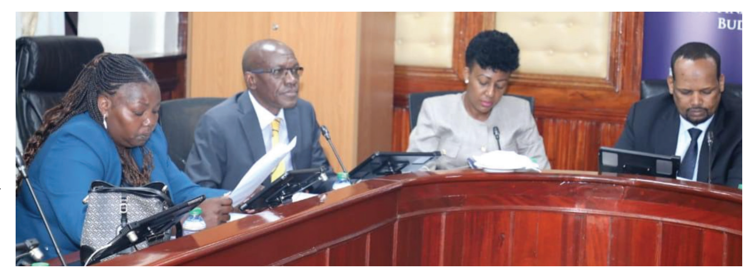
A session of the Senate Standing Committee on Finance and Budget presided over by Mandera Senator, Ali Roba (Right).

The monthly disbursement to counties is set at an average of 8 percent of the total