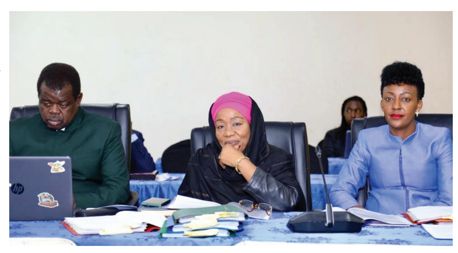
Members of the Senate Committee on County Public Investments and Special Funds during a session last week with Busia County Governor Paul Otuoma.

"You must take a hands-on approach in steering the Company," Senator