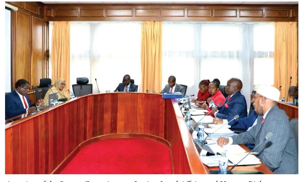
A session of the Senate Committee on Justice, Legal Affairs and Human Rights (JLAHRC) with IEBC leadership last week.

election expenses, the committee dissected the high costs involved in conducting the by-election. Notable expenditures included Kshs 83,462,700 for wages, Kshs 47,585,500 for transportation, Kshs 43,133,300 for meals, Kshs 14,149,082 for printing, and Kshs 10,476,000 for security, in addition to miscellaneous expenses. Altogether, the by-election costs amounted to a whopping Kshs 262,990,772.