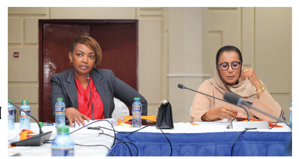
Nominated Senator Karen Nyamu takes the Senate Committee on Information, Communication and Technology through her proposed Digital Literacy Bill, 2023.

The Members of the ICT Committee subsequently deliberated on the contents and the consequences of the proposed legislation on Kenyans and promised to