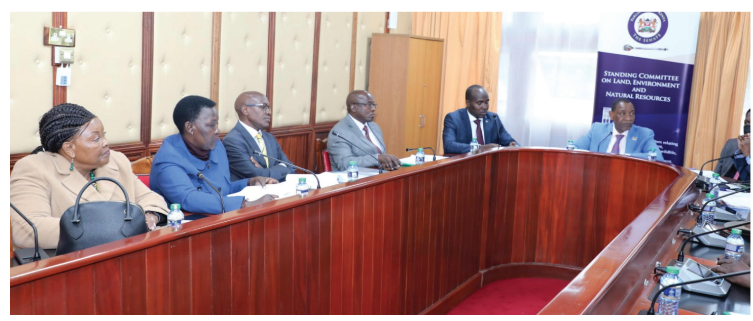
The Senate Committee on Land, Environment and Natural Resources in session last week.

The petitioners claim that due process was followed including public participation, environmental impact assessment and approval by the Cabinet. A Cabinet Memorandum was