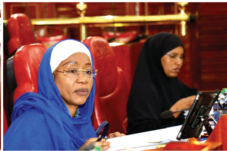
Left; A student leader addresses the Senate Committee on Health which is hearing a petition on the dispute between Kenyatta University and Kenyatta University Teaching, Research and Referral Hospital. Right; Members of the Senate Committee on Health

he Senate Committee on Health last week met with representatives of students, lecturers and leadership of Kenyatta University and management of the Kenyatta University Teaching, Research & Referral Hospital (KUTRRH) following a petition on the use of the hospital by medical students.