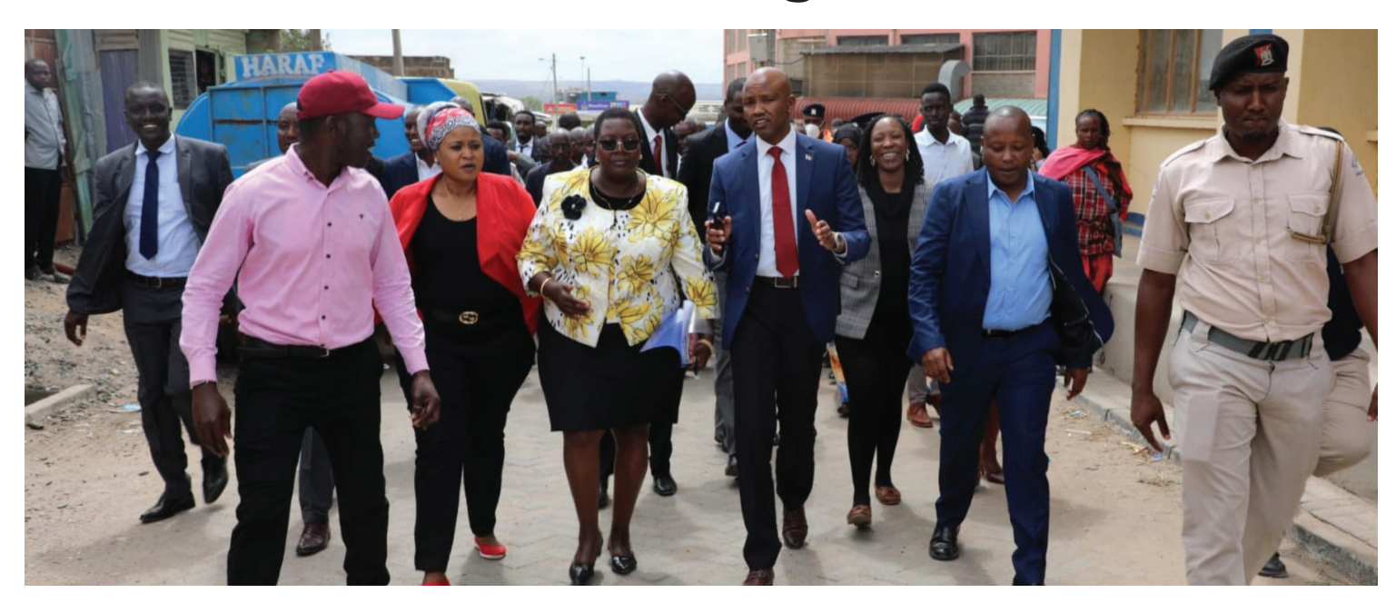
Members of the Senate Committee on Devolution and Intergovernmental Relations led by Senator Peris Tobiko tour the Kajiado Municipality Market last week.

Senate Committee on Devolution and Intergovernmental Relations led by Senator Peris Tobiko toured Kajiado County, to inspect Kajiado Municipality Market following a petition to the Senate by Kajiado Municipality Market Traders.