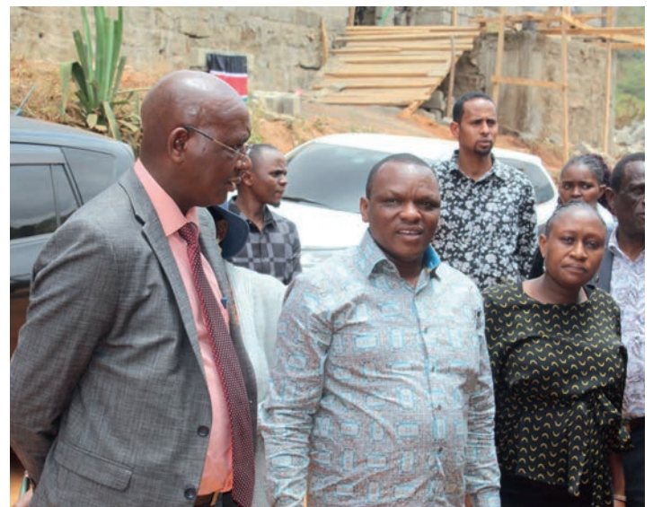
Monica Wautu Secondary School in Kaiti Constituency. Upon completion the project is expected to provide teachers with much needed offices to boost efficiency in service delivery.