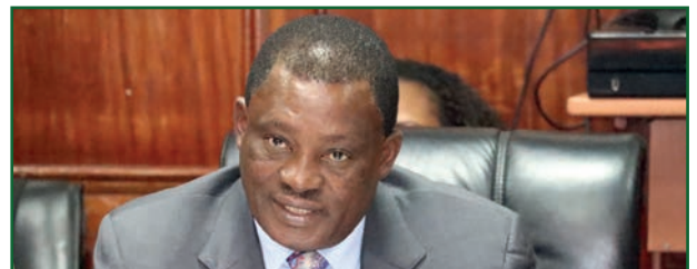
The Attorney General, Hon. Justin Muturi, appeared before Public Investments Committee on Governance and Education to respond to Members concerns about institutional ownership and accountability