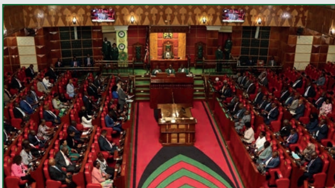
A sitting of the National Assembly during debate on the Motion aimed at compelling the National Government, particularly the ministry of Health, to establish a comprehensive national policy for deworming of school-going children