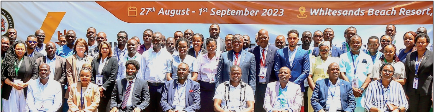
27 th August - 1 st September 2023 Whitesands Beach Resort,

Delegates from across Africa who attended the just concluded 6th Annual Conference for the African Network of Parliamentary Budget Office (AN-PBO) in Mombasa County, pose for a group photo on the first day of the Conference. The Conference was officially opened by the Chairperson, Budget and Appropriations Committee, Hon. Ndindi Nyoro (Kiharu). Clerk of the National Assembly, Mr. Samuel Njoroge and Clerk of the Senate Mr. Jeremiah Nyegenge also made remarks during the opening session.