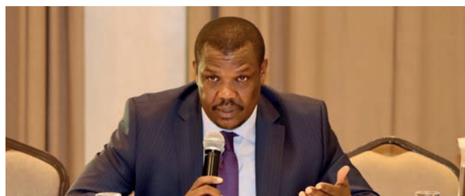
Bumula Member of Parliament, Hon. Wamboka Wanami when he appeared before the Justice and Legal Affairs Committee.