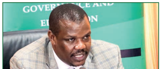
The Chairperson of the Public Investments Committee on Governance and Education, Hon. Jack Wamboka (Bumula), seeking clarification from the Attorney General, Hon. J.B. Muturi during a meeting last week