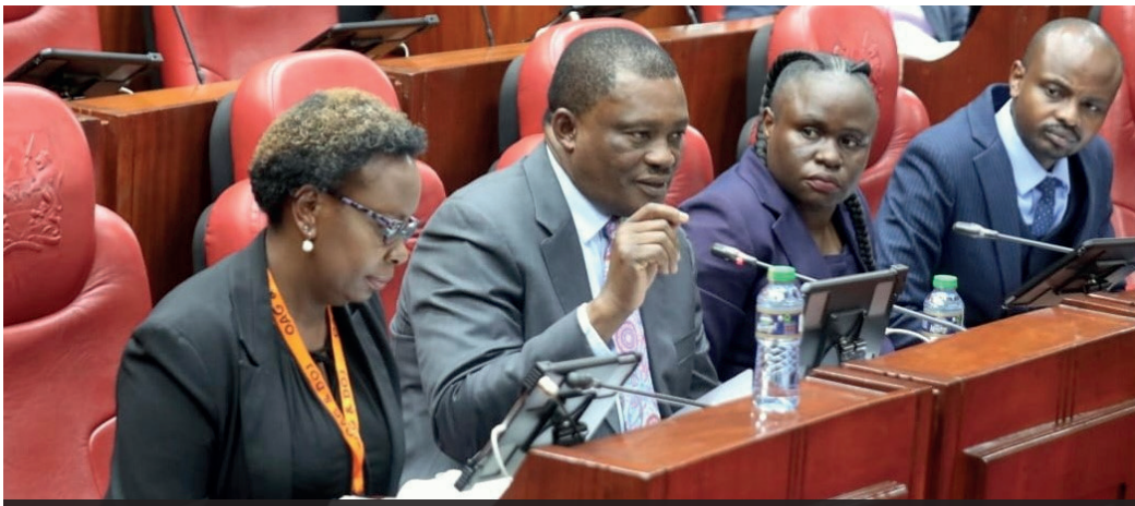
Attorney General Hon. Justin Muturi and the team from the office of the Solicitor General during a meeting with the Ad Hoc Committee on Wednesday, August 30, 2023.

PLENARY | COMMITTEES | BUNGE MASHINANI | CLIQUE & CLICKS | QUESTION TIME