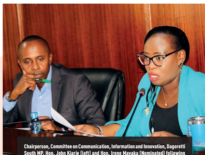
Chairperson, Committee on Communication, Information and Innovation, Dagoretti South MP, Hon. John Kiarie (left) and Hon. Irene Mayaka (Nominated) following the presentation by members of the American Chamber of Commerce (AMCHAM)