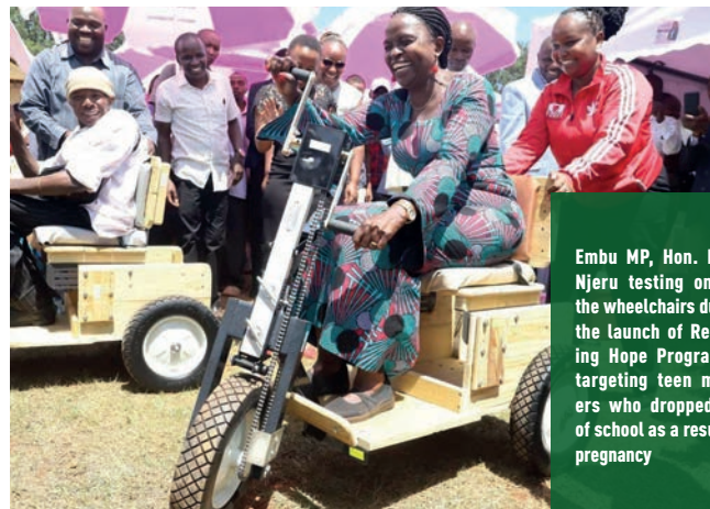
Embu MP, Hon. Njoki Njeru testing one of the wheelchairs during the launch of Restoring Hope Programme targeting teen mothers who dropped out of school as a result of pregnancy

E mbu MP, Hon. Njoki Njeru launched “Restoring Hope Program” targeting teen mothers who had previously stopped schooling as a result of pregnancy.