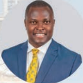
HON. NDINDI NYORO, CBS, M.P.

COUNTRY MANAGER/EXECUTIVE DIRECTOR INTERNATIONAL BUDGET PARTNERSHIP KENYA KEY NOTE SPEAKER