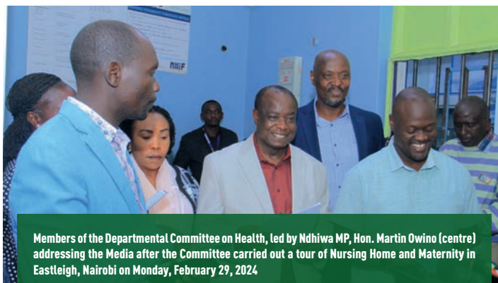
Members of the Departmental Committee on Health, led by Ndhwa MP, Hon. Martin Owino (centre) addressing the media after the Committee carried out a tour of Nursing Home and Maternity in Eastleigh, Nairobi on Monday, February 29, 2024

T he Departmental Committee on Health is calling for the establishment of an independent regulatory body tasked with licensing and overseeing operations of private hospitals across the country.