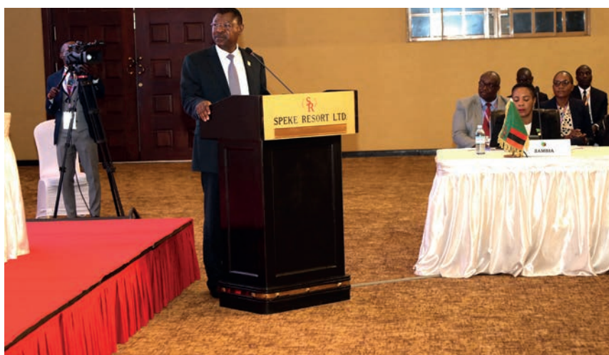
Speaker Wetang'ula delivering the keynote address on climate change during the 27th CSPOC convention held in Kampala, Uganda