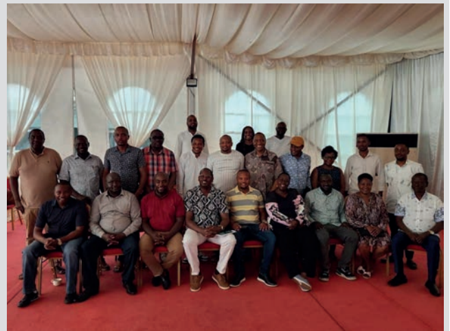
Members drawn from the Committee on Agriculture and Livestock and Budget and Appropriations Committees pose for a photo with representatives from AGRA after their meeting last week

M embers of Parliament from the Agriculture and Livestock and Budget and Appropriations Committees recently engaged with the Alliance for a Green Revolution in Africa (AGRA) to discuss the role of Parliament in enhancing Kenya's food system.