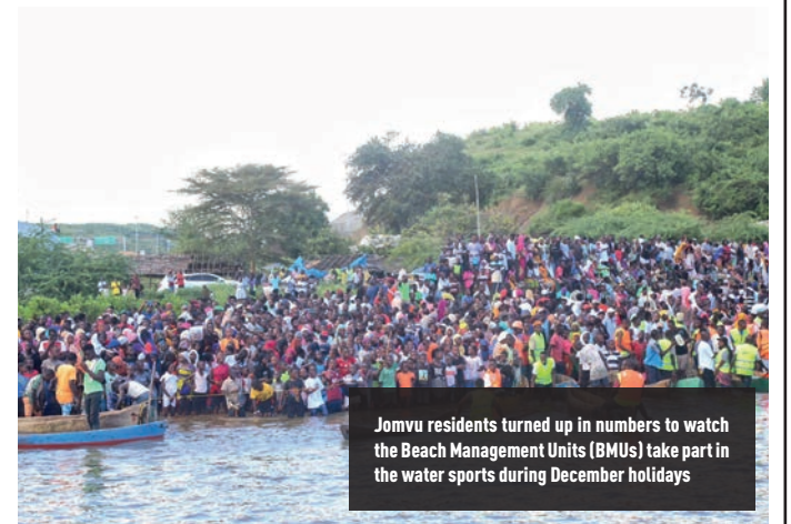
Jomvu residents turned up in numbers to watch the Beach Management Units (BMUs) take part in the water sports during December holidays

The locals recognized the events dual impact on the community. Not only does it provide a platform for showcasing their talents and promoting local culture, but it also serves as a catalyst for economic growth.