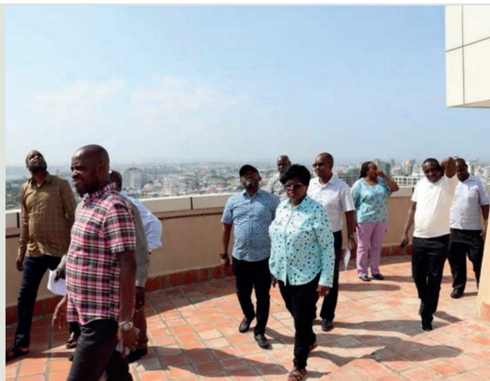
A section of the Members of the Public Investments Committee on Commercial Affairs and Energy when they visited Kenya Maritime Authority Headquarters in Mombasa last week