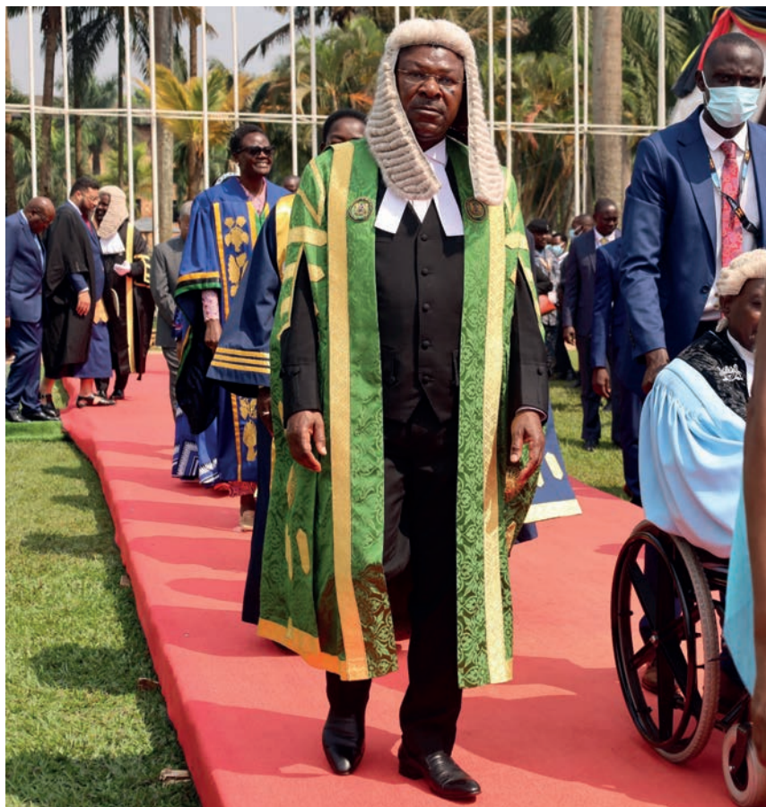
Speaker, Hon. (Dr.) Moses Wetang'ula during a procession of the Commonwealth Speakers attending the 27th CSPOC convention

The convention, attended by thirty-three Speakers and Presiding Officers from over 25 Commonwealth Parliaments globally, addressed various issues, including inclusive Parliaments, security for Members of Parliaments, health and well-being of legislators, gender, and youth governance.