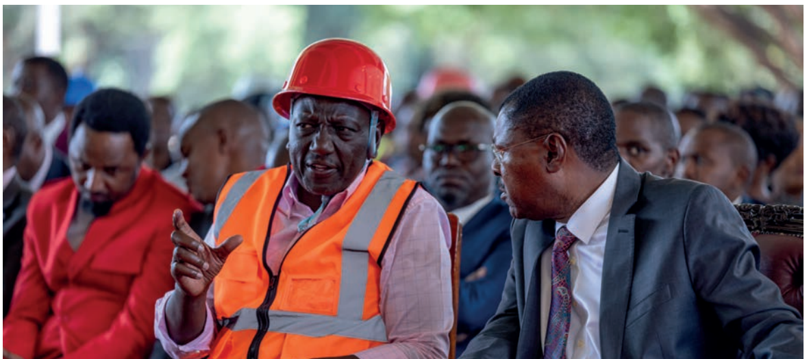
His Excellency President, Dr. William Ruto (with a helmet) explains a point to Speaker of the National Assembly, Rt. Hon. (Dr.) Moses Wetang'ula (right) who is keenly following