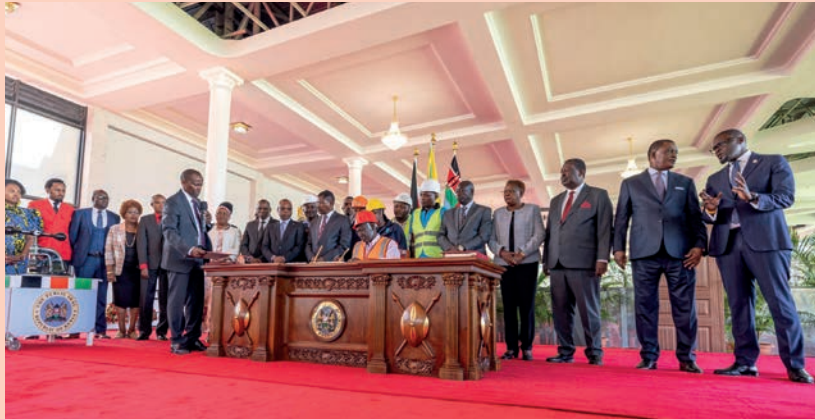
The Leadership of Parliament and the Executive applauding after the President, His Excellency, Dr. William Ruto (seated in a red helmet) signed the Affordable Housing Bill into law

The enactment of the law will see Kenyans gain access to various categories of affordable housing. The categories comprise affordable social housing units, targeting persons whose monthly income is below Kshs.20,000; affordable housing units targeting persons whose