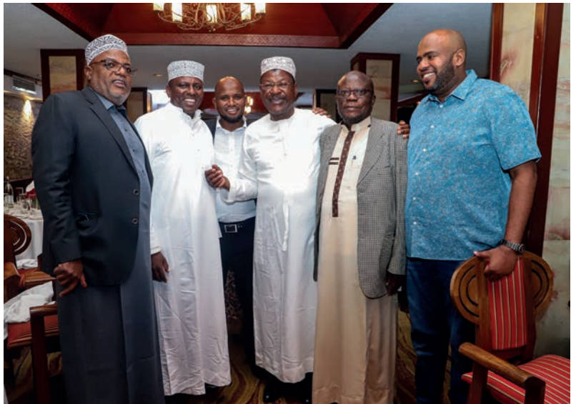
Speaker of the National Assembly, Rt. Hon. (Dr.) Moses Wetang'ula (third right) poses for a photo with a section of MPs after an Iftar dinner jointly hosted by the National Assembly and the Senate on Friday, March 21, 2024. The Speaker recognized the significance of the holy month of Ramadhan to Muslims noting that Iftar creates an ideal opportunity to come together, strengthen relationships and show gratitude for the blessings of life