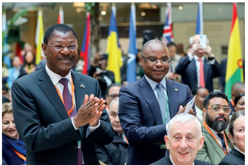
Speaker of the National Assembly, the Rt. Hon. (Dr.) Moses Wetang'ula (standing left) and Speaker of the Senate, Rt. Hon. Amason Kingi (also standing) applauding during the 75th Commonwealth Anniversary at the Commonwealth House, London

The Commonwealth Day is an Annual Event observed across the Commonwealth countries in Africa, Asia, the Caribbean, America, the Pacific and Europe.