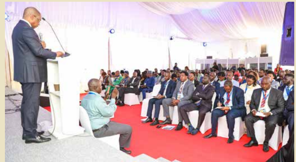
Speaker Amason Kingi gives his remarks during the opening ceremony of the Parliamentary Dialogue Conference in Nairobi on September 5, 2023.

egislators drawn from African Parliaments have agreed to work towards laws and policies that encourage and accelerate the transition to clean and sustainable energy sources within the continent.