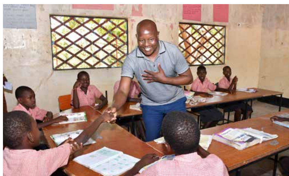
Senator Lenku Kanar Seki greets pupils at St. Bernadette School.