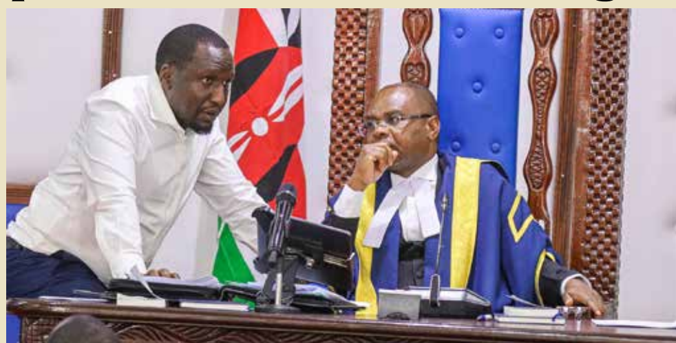
Majority Leader Aaron Cheruiyot consults Speaker Amason Kingi during debate on The Facilities Improvement Financing Bill, 2023 in the County Assembly of Turkana premises.

The law will allow health facilities address short-term emergency procurement of consumables that would have