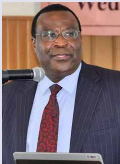
Speaker Emeritus Ekwee Ethuro: Senate Mashinani is key in implementing devolution

“I am happy that the Senate leadership made the decision [to sit in Turkana County]. This is proof that representation and oversight are not theoretical. This is important in encouraging conversation on devolution.”