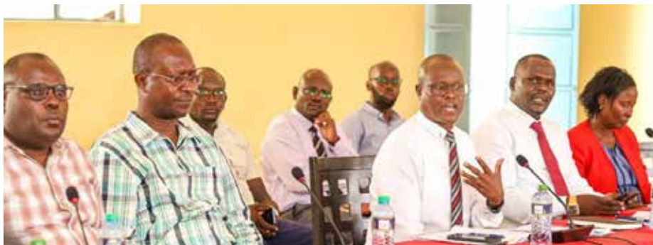
Stakeholders on the Community land in Turkana during the meeting with the Committee on Lands in Lodwar town.

The Committee on Land, Environment and Natural Resources has advised communities in Turkana to work together to ensure that Community land in the county is registered.