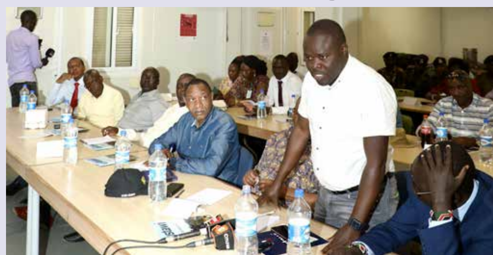
Senator Eddy Aketch makes his contribution when the Committee on Energy toured the site of oil drilling in Lokichar, Turkana County.

"How can a company use your land or your house to conduct business or profit then pay you later? I thought it was proper to pay the landlord in advance,"