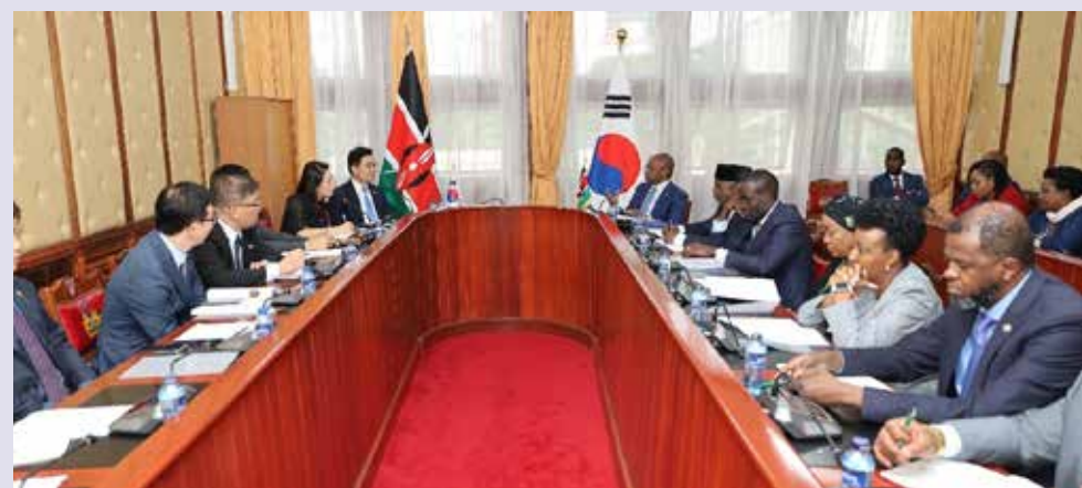
Speakers Kingi and Kim Jin-Pyo lead a meeting of the delegations of the two Parliaments on Thursday.

Noting that his visit to Kenya came 10 years after a similar one by his predecessor, Speaker Kim registered his appreciation for the warm relations Kenya and Korea have nurtured, resulting in great mutual benefits for the two countries.