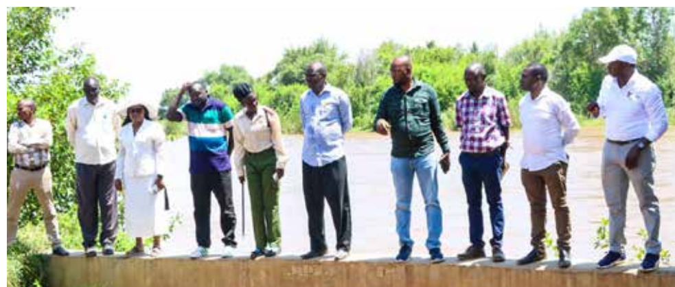
Members of the Agriculture Committee with the officials from the National Irrigation Authority at the Katilu Irrigation Scheme during the visit.

The committee toured the Scheme and held interactive sessions with officials of the County Government, local leaders and farmers, and other agriculture stakeholders over the state of the Scheme.