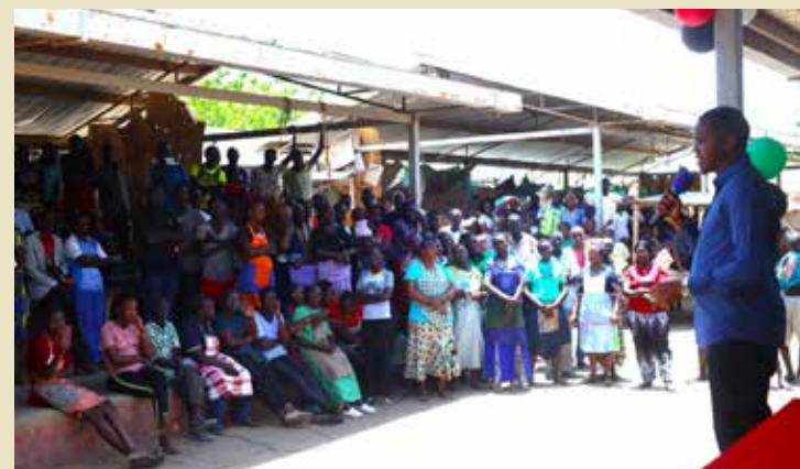
Senator Chesang addresses traders at the Lodwar Fresh Produce and Livestock Market during the launch of the free Wi-Fi portal in the town.

The Senators expressed their satisfaction with the ICT installations in Turkana County and reiterated their support in distributing the ICT infrastructure across the country.