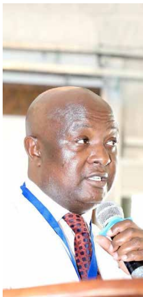
Senator Godfrey Osotsi

In a historic moment for devolution and healthcare, the Senate passed the Primary Healthcare Bill 2023 with significant amendments during Senate Mashinani in Turkana County.