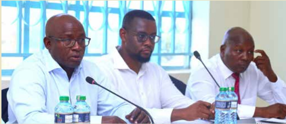
National Security Committee Chairman William Cheptumo (left) and Senator Kanar Seki follow proceedings during a meeting between the Committee and members of Turkana County Security team.

The Turkana County Security team has said the National Police Reservists add value in the fight against crime in the area and has proposed the National Government increase their numbers to help stem cases of insecurity cases in the County.