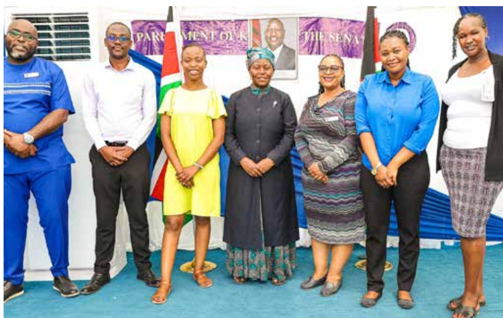
Public Communications Officers at the Senate Exhibition tent at the County Assembly of Turkana premises. The Author is on the second left

Until 2023 Senate Mashinani came around, I had never set foot in Turkana County. The much I knew about the County was through tales from friends who had the occasion to visit the area or news from the mass media.