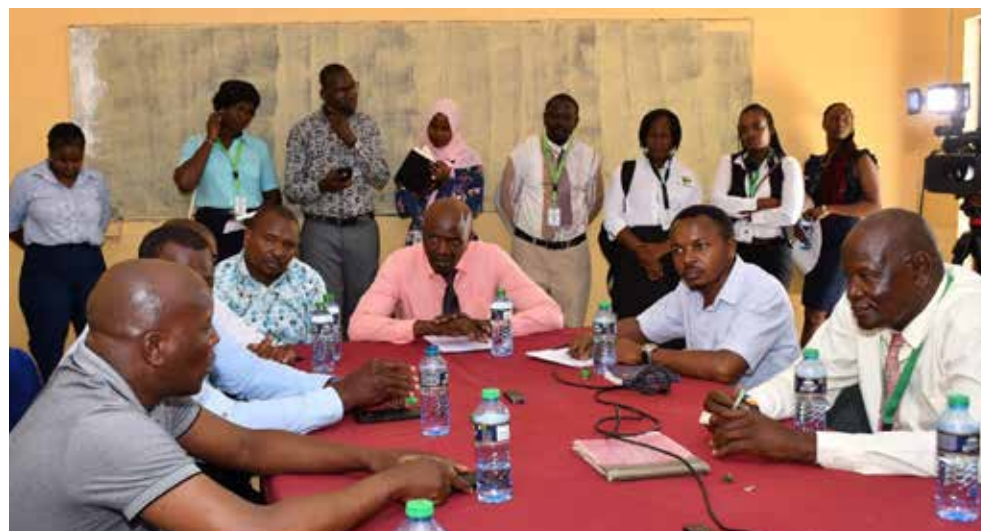
Consultative meeting between Senators, the Education Committee of County Assembly and teachers at St. Bernadette School in Lodwar.