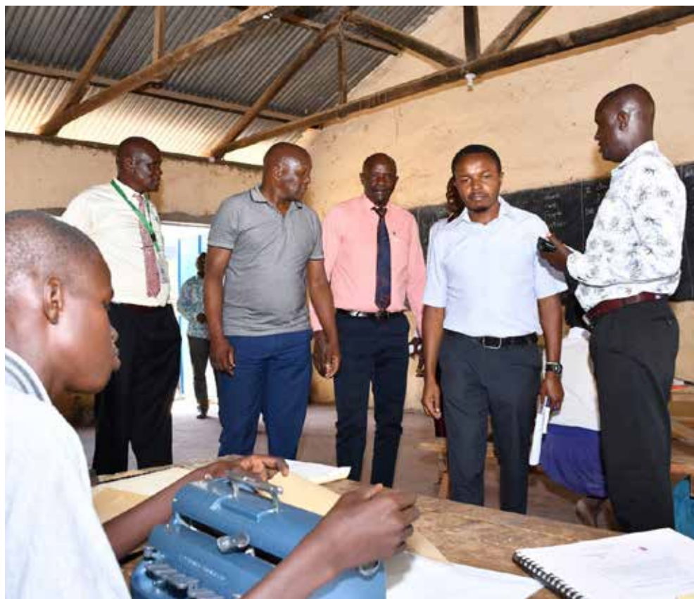
Education Committee members inspect classrooms at St. Bernadette in Lodwar town.

As part of its outreach programme during the third Senate Mashinani, the Committee on Education conducted an extensive tour of education facilities in Turkana County.