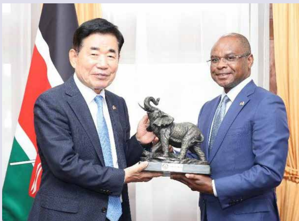
Speaker Kingi hands a gift to Rt Hon Kim Jin-Pyo, the Speaker of the National Assembly of the Republic of Korea after the meeting between the two on Thursday, October 5, 2023.

Parliaments of Kenya and Korea have agreed to explore new frontiers in their partnership with a view to enhancing their capacity for effective legislative work.