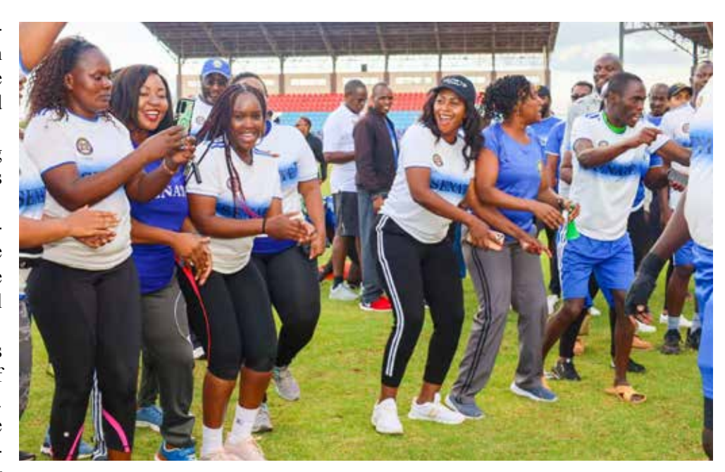
Staff of the Senate cheer their teams during the Senate Sports Day in October. .

at the disposal of employees, the Senate organises various sessions where employees are brought up to speed on matters wellness by top-flight professionals.