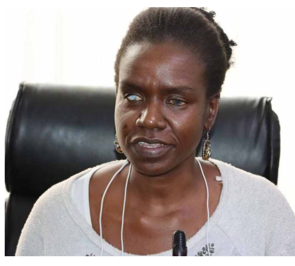
Senator Crystal Asige

enator Crystal Asige has raised concerns about the rampant discrepancies noted in the just released 2023 Kenya Certificate of Primary Education (KCPE) results where incorrect marks were awarded, wrong subjects graded and questionable results published.