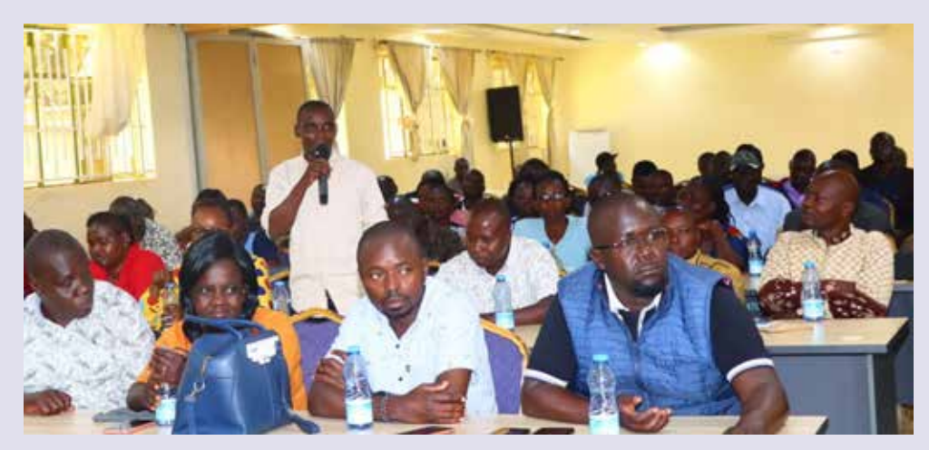
A section of Bungoma teachers who attended the meeting with the Trade Committee in Bungoma town.

Committee of the House has directed the Teachers Service Commission (TSC) to stop remittance of teachers' contributions to the Metropolitan National Sacco until the outstanding issues are resolved.