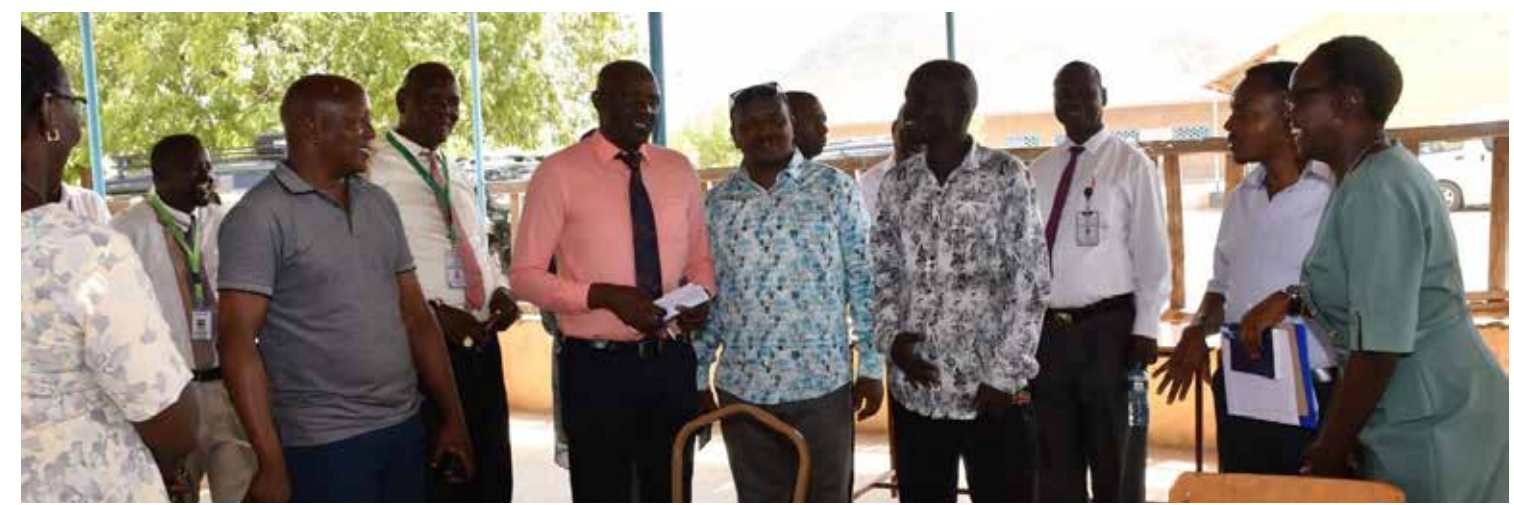
The Education Committee when it visited Nakwamekwi and the Education Assessment Resource Centre (EARC) at the Lodwar Mixed Primary School during the Senate Mashinani in Turkana County.

rom July 1, the Committee on Education held a total of 34 sittings and considered 18 Statements sought on the floor of the House.