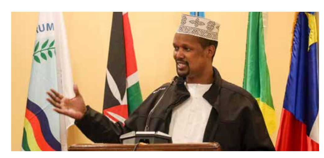
Senator Ali Roba, the chair of the Finance and Budget Committee, addresses delegates during the closing ceremony of the FP-ICGLR conference on behalf of Speaker Amason Kingi.

The Committee on Finance and Budget considered and tabled five key Bills and several Statements during its more than 90 meetings held between July 1 and November 28, 2023, setting the stage for cash flow in the 47 county governments.