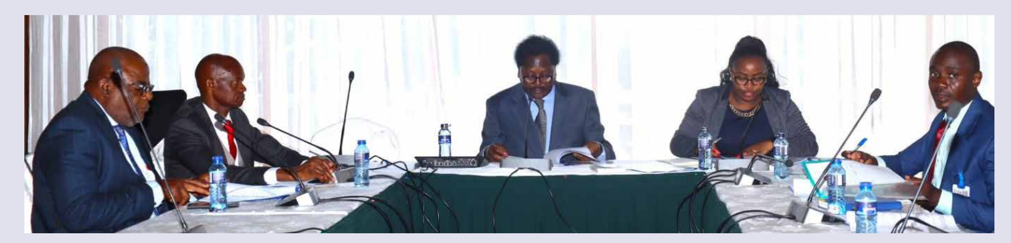
The Committee on Labour, chaired by Senator Julius Murgor, (Centre) during one of its sittings. Other members in the picture are Senator Mohamed Faki and Munyi Mundigi.

The Committee on Labour and Social Welfare considered two Bills, six Petitions and 64 Statements during the period.