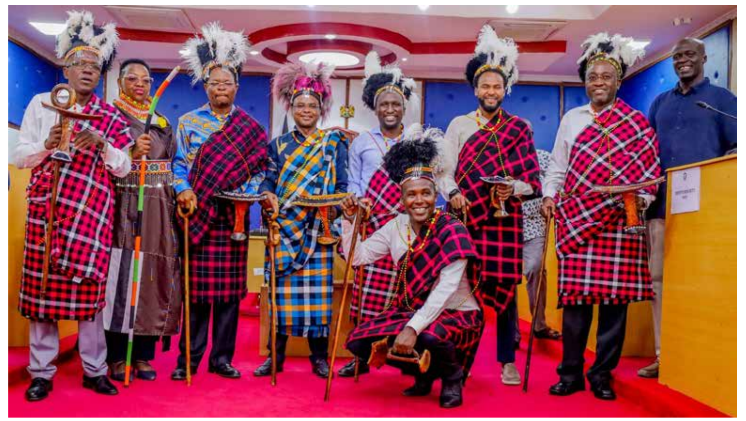
The Senate leadership pose for a picture within the precincts of the County Assembly of Turkana after they were crowned Turkana elders during the Senate Mashinani sittings in Turkana County. Senate Mashinani is one of the key activities the House conducted in the Second Session that ended on Thursday.

The Senate has considered 59 Bills in a year in which rules were amended to allow Cabinet Secretaries to appear in the House to answer Members' questions. Five of the Bills have been enacted into law, debate on eight has been concluded while 31 Bills are pending in various stages in the House.