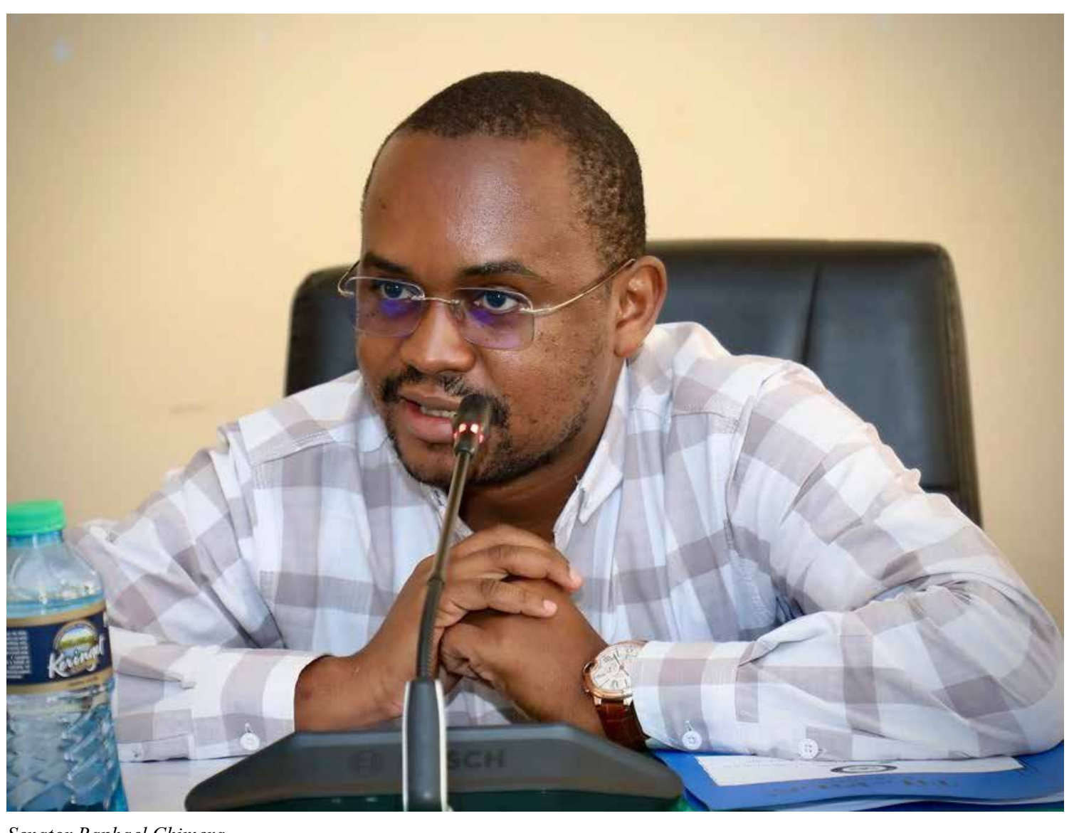
Senator Raphael Chimera.

The Senator says having former governors sit in the two legislatures would lead to conflict of interest and interfere in their decision-making process.