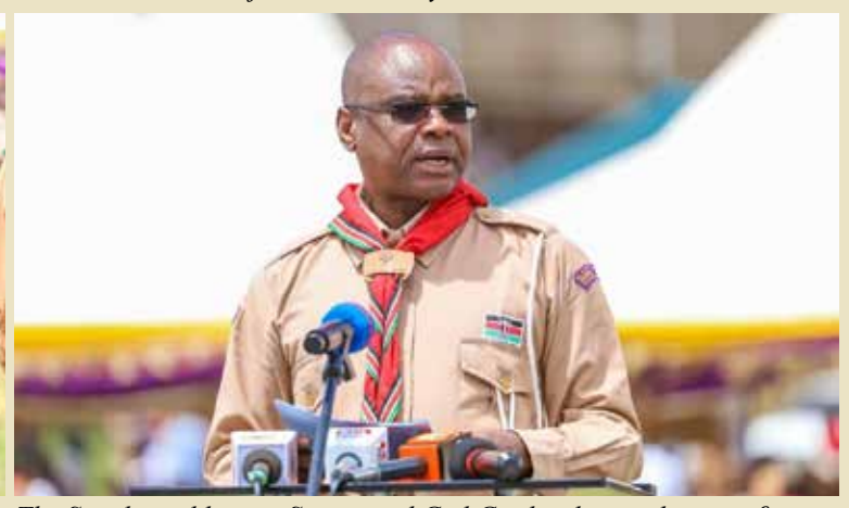
The Speaker addresses Scouts and Girl Guides during the campfire event on Friday night at the Kaiyaba Scout Camp.