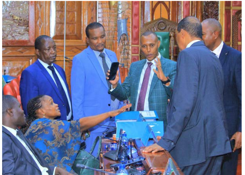
Members of the Departmental Committee on Defence, Intelligence and Foreign Relations conversing on the sidelines of the approval hearings for persons nominated for appointment as Ambassadors, High Commissioners, Permanent Representatives and Consuls-General