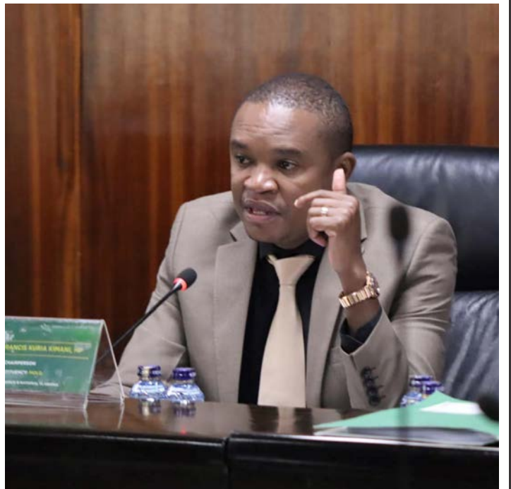
Chairperson, Departmental Committee on Finance and Planning, Hon. Kuria Kimani during a post Committee sitting at Continental House, Parliament Buildings

including loans and promotional offers, conducted through telecommunication platforms from cybercriminals.