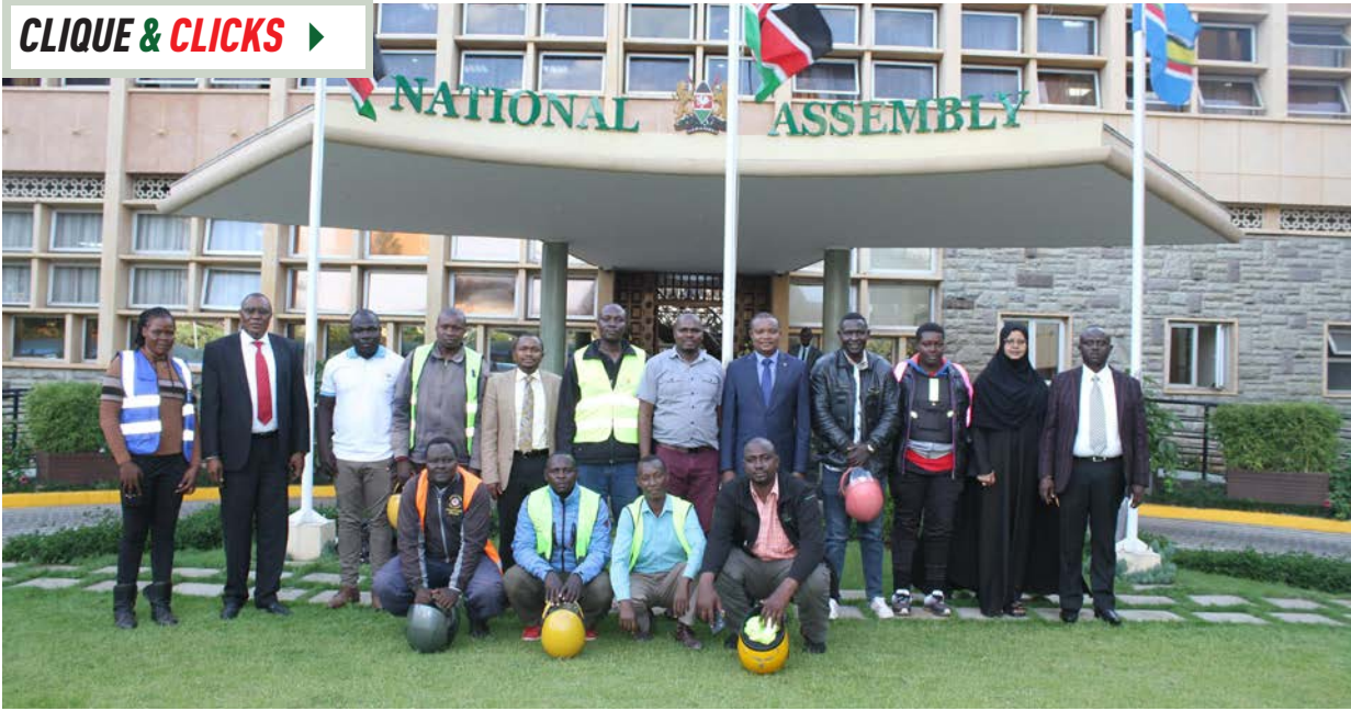
Members of the Departmental Committee on Finance and National Planning led by the Chairperson, Hon. Kuria Kimani (in blue suit and tie) pose for a photo with the members of Kenya Boda Boda Association after a meeting to deliberate on how to cushion the Association's membership from exploitative tendencies by lenders