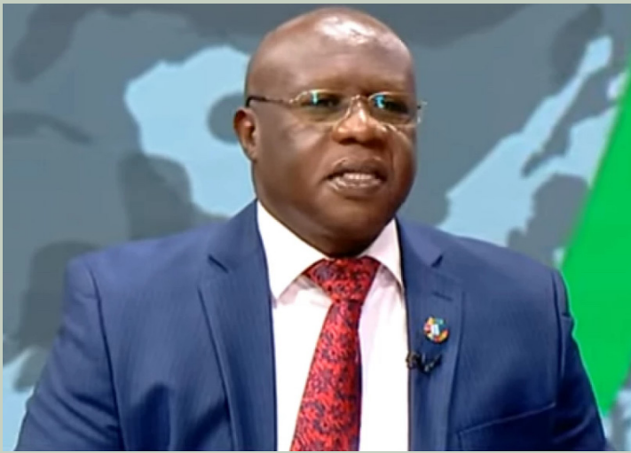
Deputy Leader of the Majority Party, Hon. Owen Baya sought a Statement on withholding of academic certificates by schools

D eputy Leader of the Majority Party, Hon. Owen Baya (Kilifi North) has raised concern over the withholding of academic certificates by school heads in both public primary and secondary schools due to fees arrears.