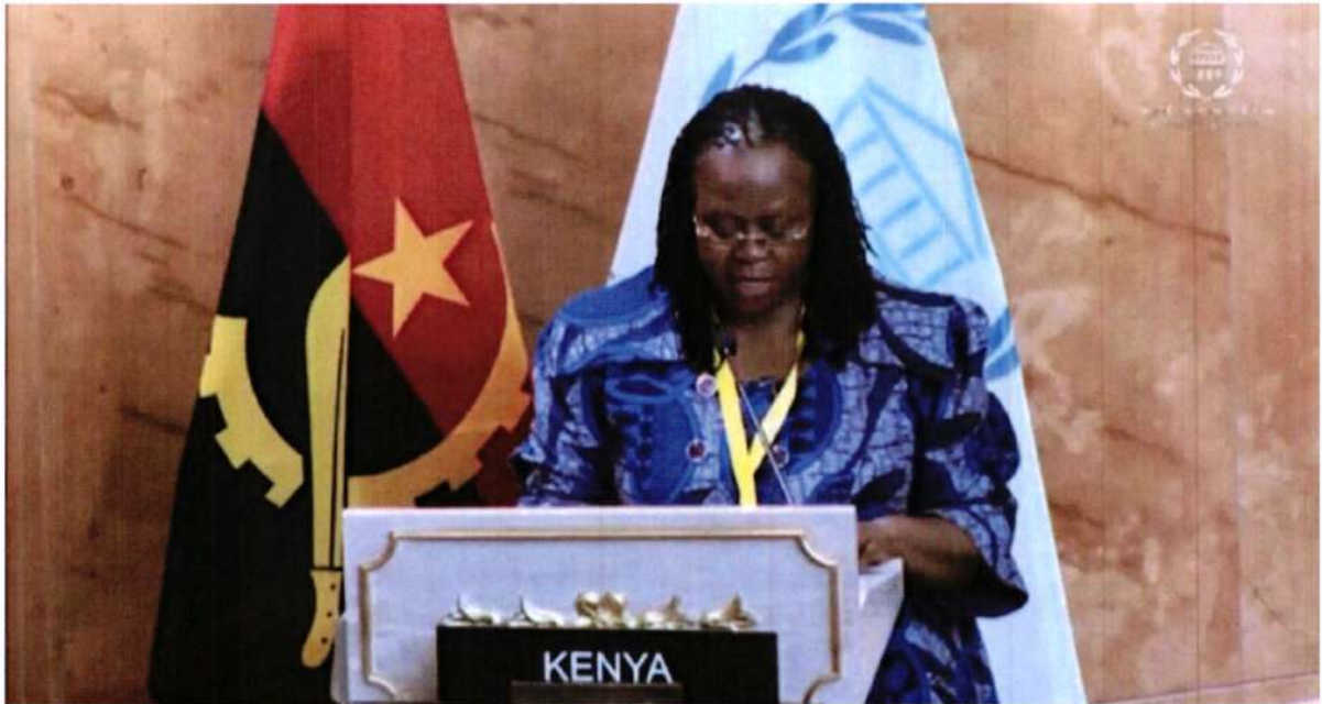
Sen. Catherine Mumma, MP, issuing her Statement at the 147 th Assembly

She reiterated the theme "Parliamentary action for peace, justice, and strong institutions" which underscores the integral role of parliamentary bodies in shaping societies that are characterized by stability, fairness, and effective Governance.