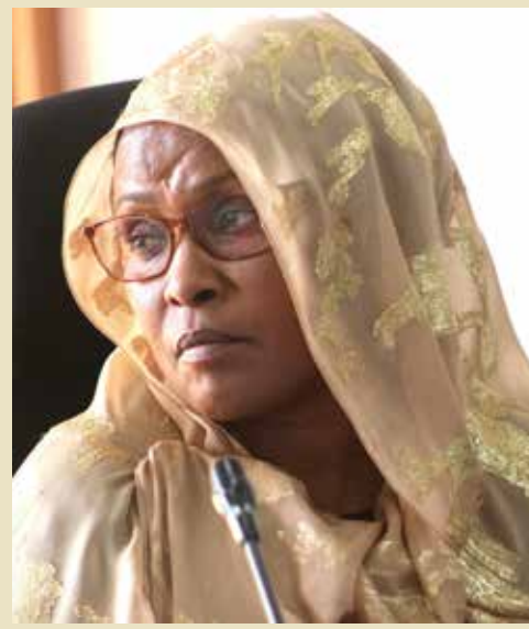
Senator Fatuma Dullo

The House has adopted the motion that sought to have cattle rustling declared a national disaster. With the resolution, a task force will now be formed to investigate the cattle rustling and banditry menace in the country.