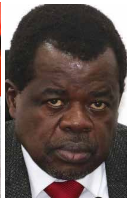
Senator Okiya Omtatah

Senator Raphael Chimera has defended the proposal seeking to bar County Governors from running for Senate and County Assembly seats, saying the proposal is justifiable because the offices directly exercise oversight over county governments.