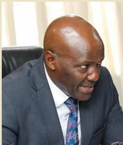
Senator Joe Nyutu