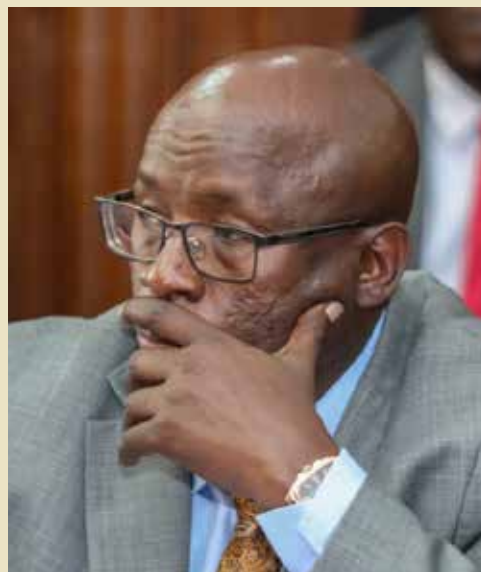
Senator William Cheptumo