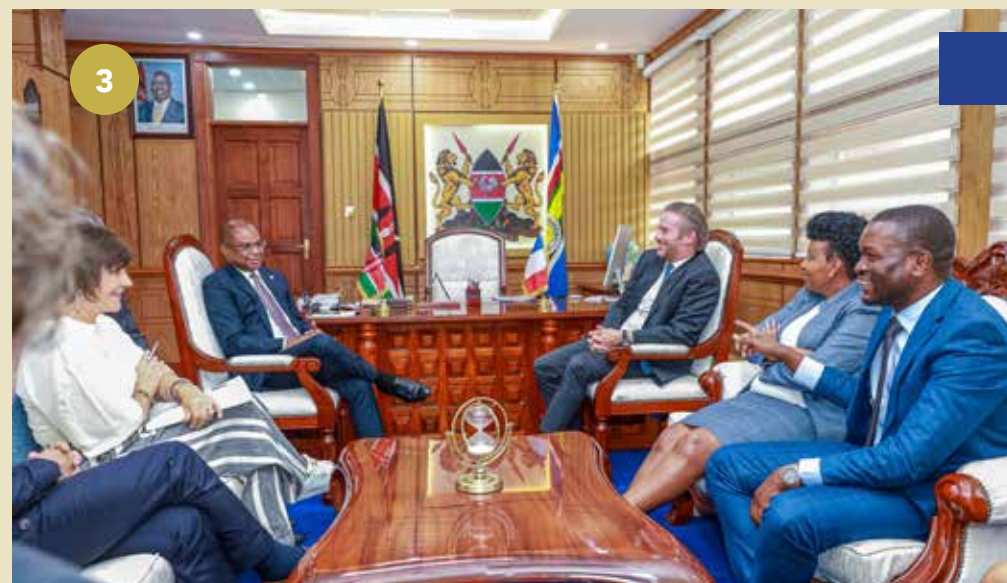
Top, Speaker Amason Kingi poses for a picture with a group of Senators from the French Parliament who paid a courtesy call on the Speakers. Below, the Speaker in discussion with the Senators. Others in the picture are Senator Edwin Sifuna and Senator Tabitha Mutinda.

K enyan Senators and their French counterparts will explore more opportunities for collaboration and partnership, as they up the ante on the role of the legislature in deepening ties between the two countries.