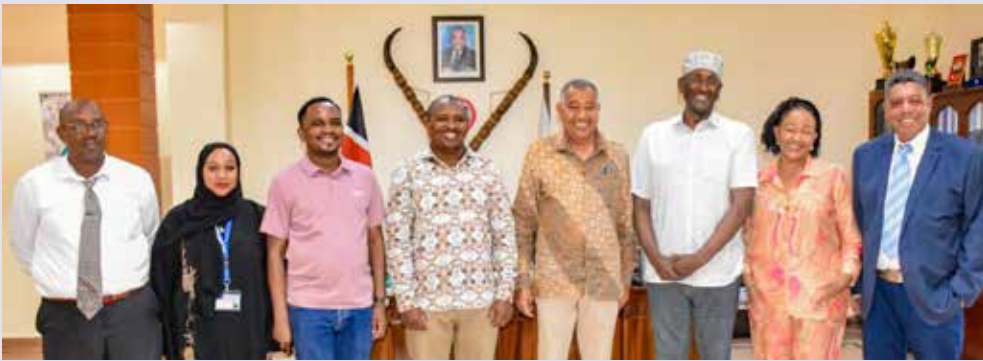
Senator Mohamed Chute (third right) and other members of the Integration and Cohesion Committee pose for a picture with Governor Issa Timamy (centre) during the tour. Other members of the committee in the picture are Senator Betty Montett and Senator Joseph Githuku (fourth left).

The Committee on Cohesion, Equal Opportunity, and Regional Integration has urged counties to adhere to the constitution when hiring staff.