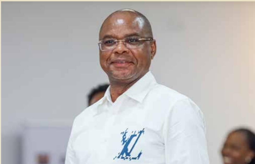
Speaker Amason Kingi directed the recruitment process to start.

The Senate has started the process of recruiting a member to the Salaries and Remuneration Commission (SRC) who will represent the interests of County Governments.