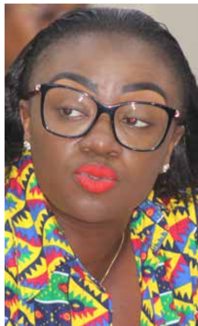
Senator Gloria Orwoba