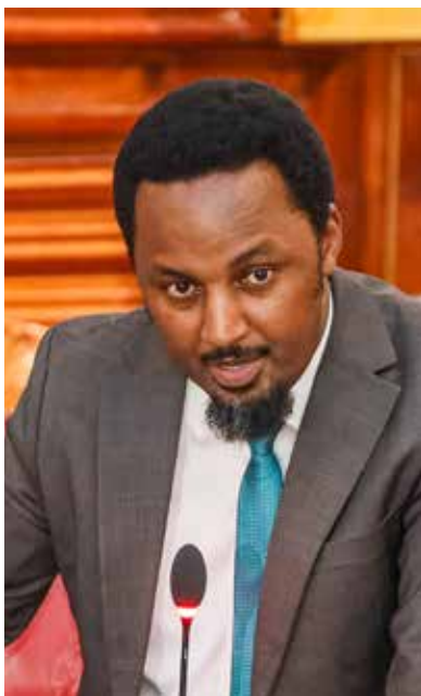
Senator Karungo Thang'wa