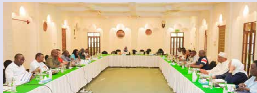
The meeting between ICT Committee and Safaricom PLC in Mombasa.