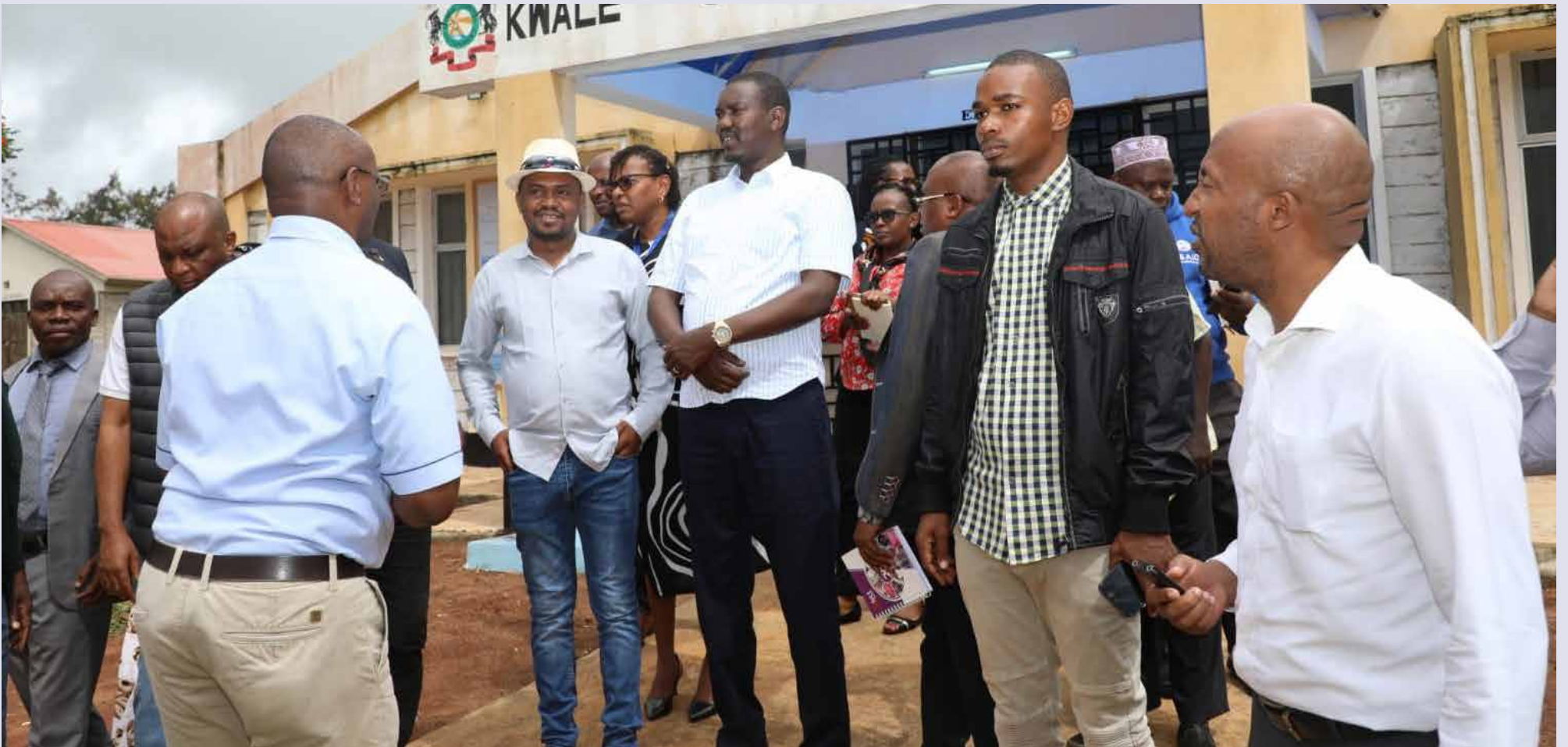
Members of the Health Committee are welcomed at the Kwale Oncology Centre during their tour of health facilities in the Coast region.

The Committee on Health has challenged the County Government of Kwale to explore ways of negotiating its own Managed Equipment Services (MES) to enhance the delivery of services to the residents of the County.