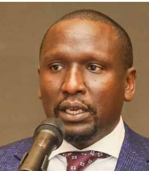
Majority Leader Aaron Cheruiyot, the sponsor of the motion..

Busia could be the first County in the larger Kavirondo region to host a sitting of the plenary of Parliament since Kenya. Kavirondo region is a swathe of land stretching from Migori County on the Tanzanian North Western border all the way to Trans Nzoia County on Uganda's Eastern border.