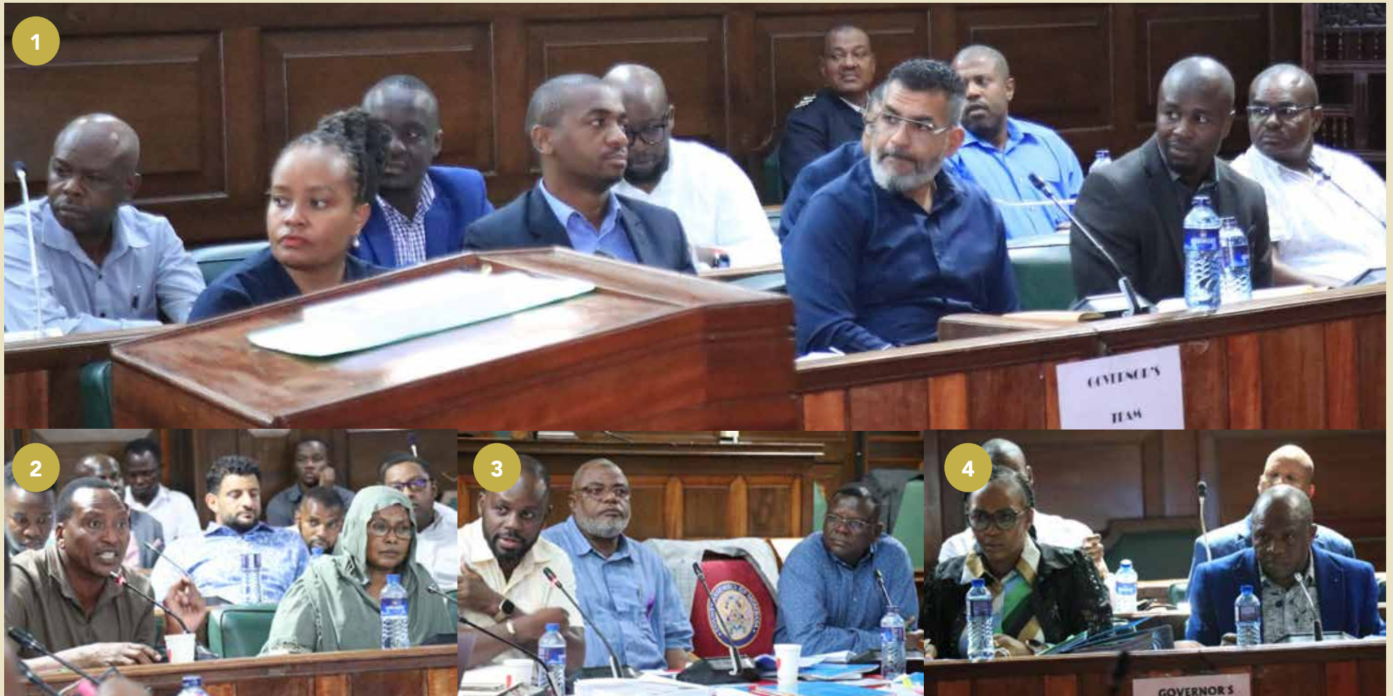
1. Governor Abdulswamad Nassir with members of his Executive Committee when they appeared before CPAC sitting in Mombasa County. 2. Senator Richard Onyonkah takes on Governor Nassir flanked by Senator Fatuma Dullo.