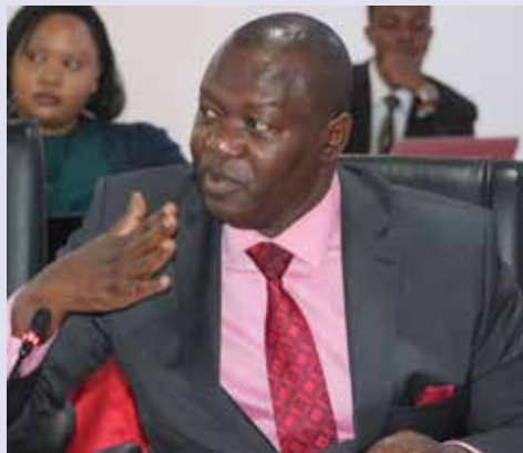
Seneta Tom Ojienda

Seneta Tom Ojienda amewasilisha ombi akitaka uchunguzi ufanywe na ripoti kuwasilishwa kwenye Seneti kuhusu hali ya Bustani ya Jaramogi Oginga Odinga na ya Victoria katika Kaunti ya Kisumu.