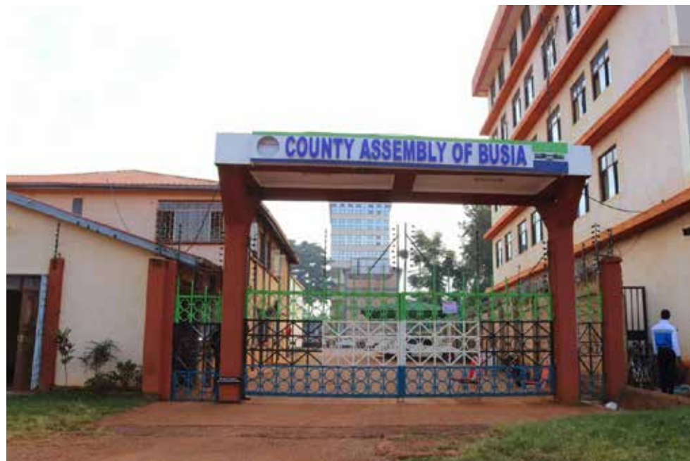
Entrance to the County Assembly of Busia.

B usia County stands in good position to host the 4th edition of Senate Mashinani, an increasingly popular Parliamentary innovation designed to take the House business closer to the people.