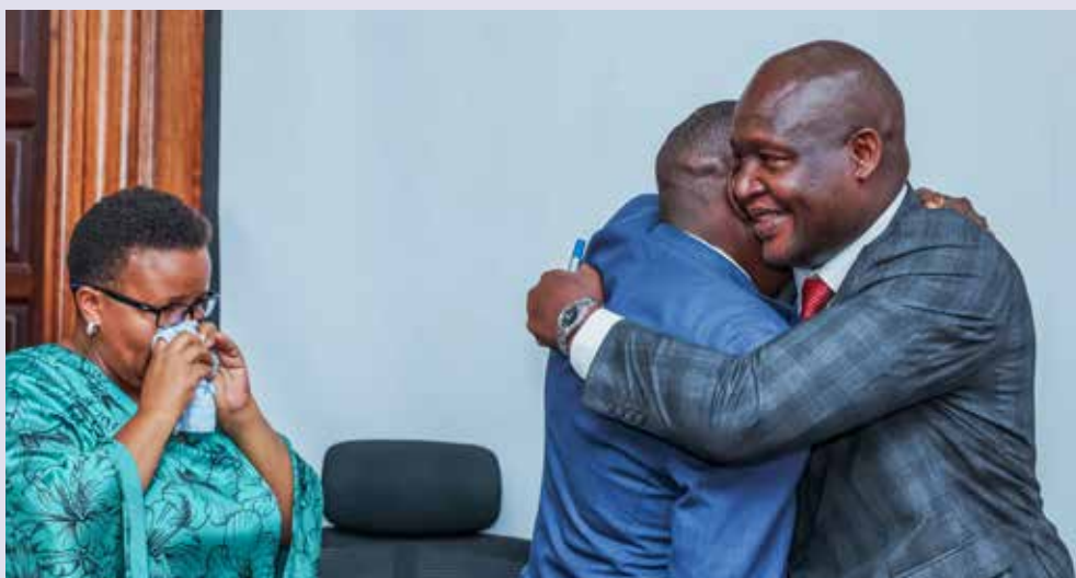
An emotional Governor Mutai celebrates with his staff after the Impeachment Motion was dropped by the Senate.