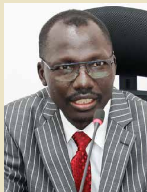
Senator James Lomenen

Senator Richard Onyonka wants the Committee on Health to submit to the House details of the Sh104 billion Integrated Health Information Technology System (IHTS).