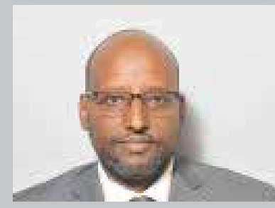
Senator Ali Ibrahim

"I support this Statement about fishermen who depend on fishing as their livelihood. If they do not fish, there is little they can do, for example, a bit of trading. The fact that they have not been compensated means that they cannot make ends meet because this is their hope. Apart from inquiring about the delayed compensation, the Committee should find a way to get a promise, word or definiteness about when the people will be compensated, what the delay is about and the date of payment. This should be one of the deliverables that will be key and necessary for the people of Lamu. This Committee should push further and seek clear answers. It should ensure that compensation is done when the promise to pay is made."