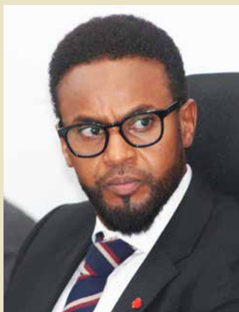
Senator Abdul Haji