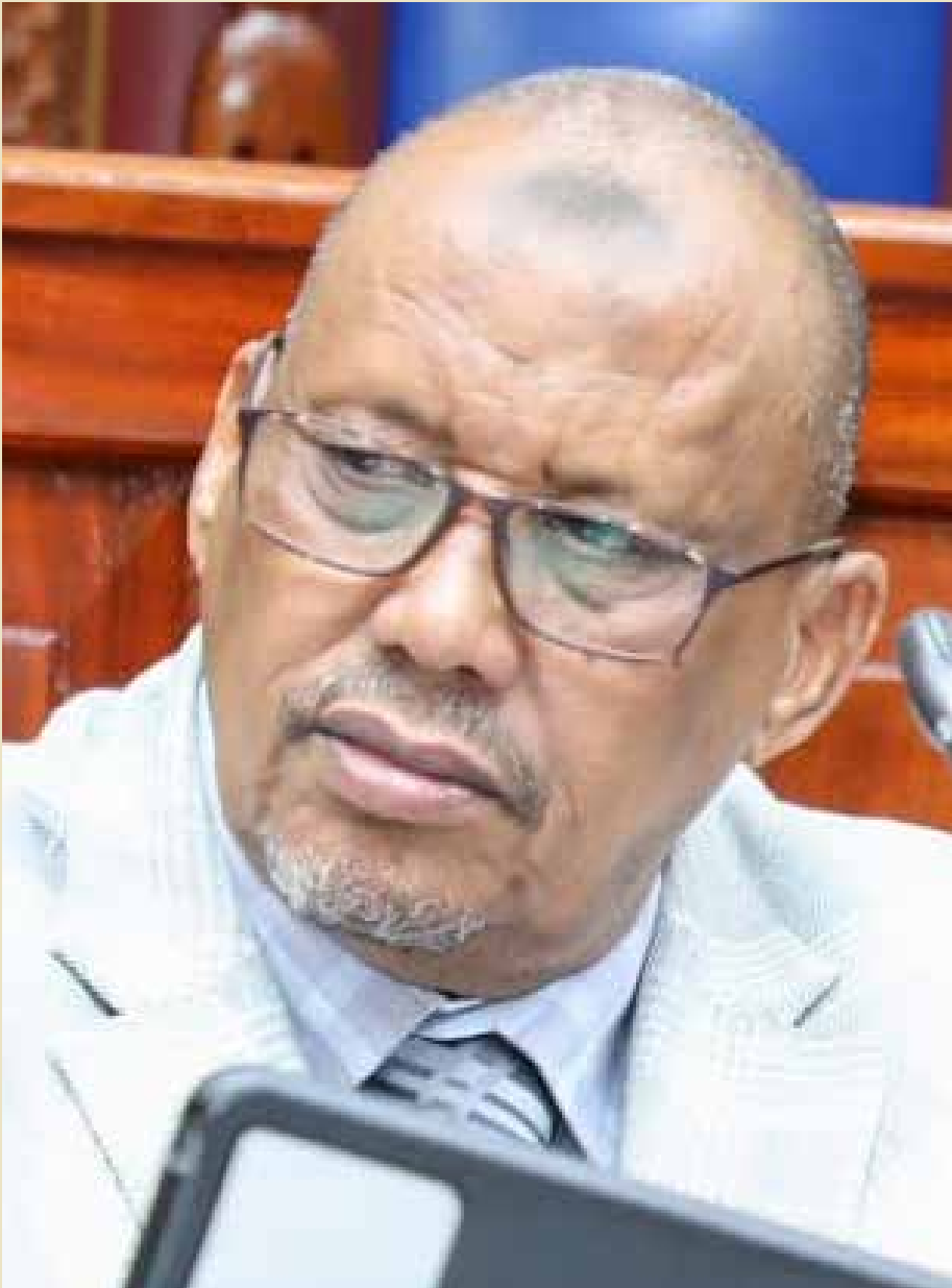
Senator Sheikh Abbas, chair Committee on Devolution.