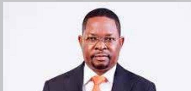
Senator Stewart Madzayo

He also wanted the Ministry to explain why the compensation had faced delays.