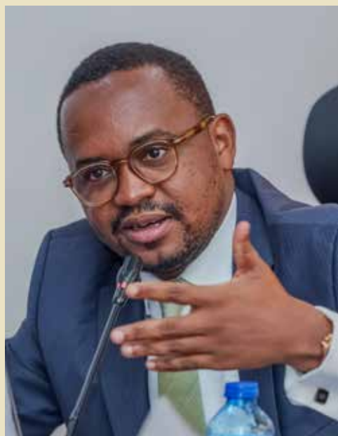
Senator Raphael Chimera