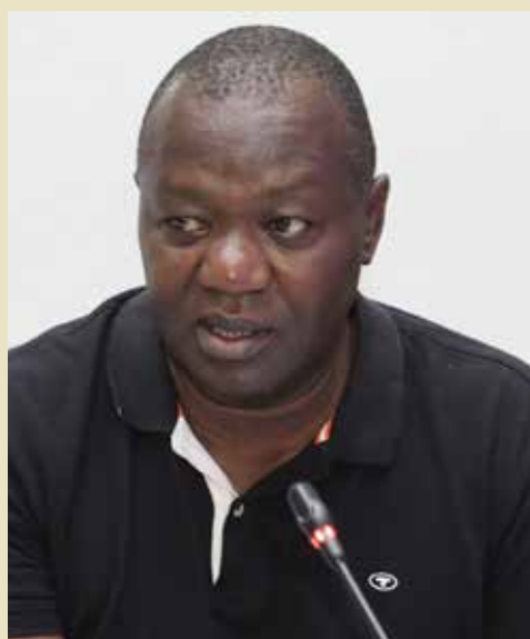
Senator Tom Ojienda

Senator Haji wants the committee to provide a list of the 47 county governments that have appointed and designated secretaries of the county public service boards as accounting officers.