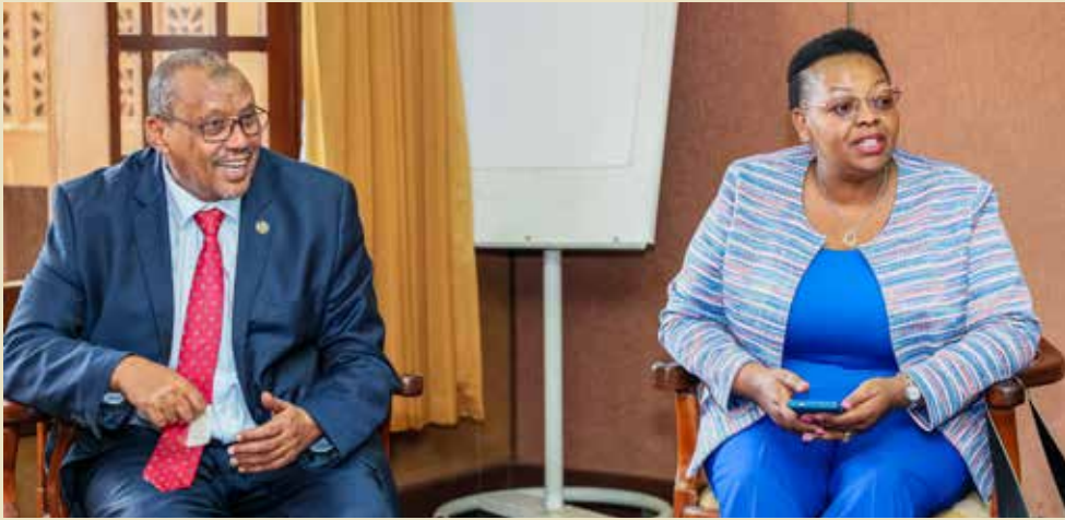
Senator Veronica Maina and Senator Sheikh Abbas, who chairs the Committee on Devolution, follow the voting during the election of chair and vice chair of the Council of Governors at Safari Park Hotel, Nairobi.

Speaker Amason Kingi has challenged the new leadership at the Council of Governors to hit the ground running and keep the momentum saying a lot remains to be done in the devolution space.