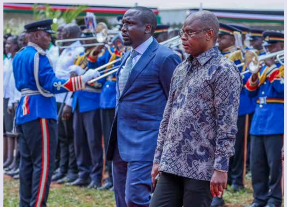
Speaker Amason Kingi and Majority Leader Aaron Cheruiyot walk to the luncheon dais at the Kwale State Lodge, Kwale County, after the Mashujaa Day celebrations.