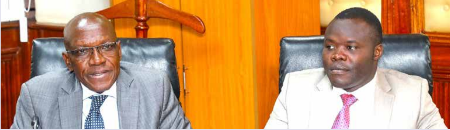
Seneta Eddy Oketch(Kulia) na Seneta Boni Khalwale kwenye Kikao cha awali cha Kamati ya Fedha na Bajeti.

Seneta Eddy Oketch anaitaka Kamati ya Habari, Mawasiliano na Teknolojia kufanya uchunguzi na kutoa ripoti kuhusu madai ya ukiukaji wa taarifa za siri za msajili unaofanywa na kampuni ya Safaricom.