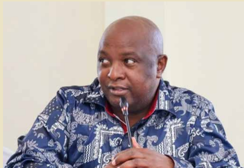
Senator Godfrey Osotsi

He wants the Committee on Labour and Social Welfare to outline measures implemented to ensure the system is user-friendly, efficient, transparent and