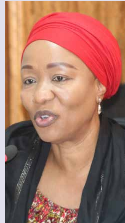
Senator Hamida Kibwana

The House has expressed outrage over the rising cases of femicide in the country, warning that it is becoming pleasurable to kill women as there is no equal response in terms of the rule of law on killers.