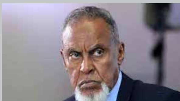
Senator Yusuf Haji

On November 15, 2016, the House debated the Treaty Making and Ratification (Amendment) Bill, 2016. The aim was to amend the Treaty Making and Ratification Act of 2012 in order to reinstate the role of the Senate in the Treaty making and ratification process. The Bill, sponsored by the Committee on National Security, Defence and Foreign Relations, was moved by Senator Yusuf Haji, who chaired the Committee.