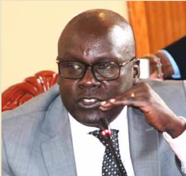
Senator William Kisang'