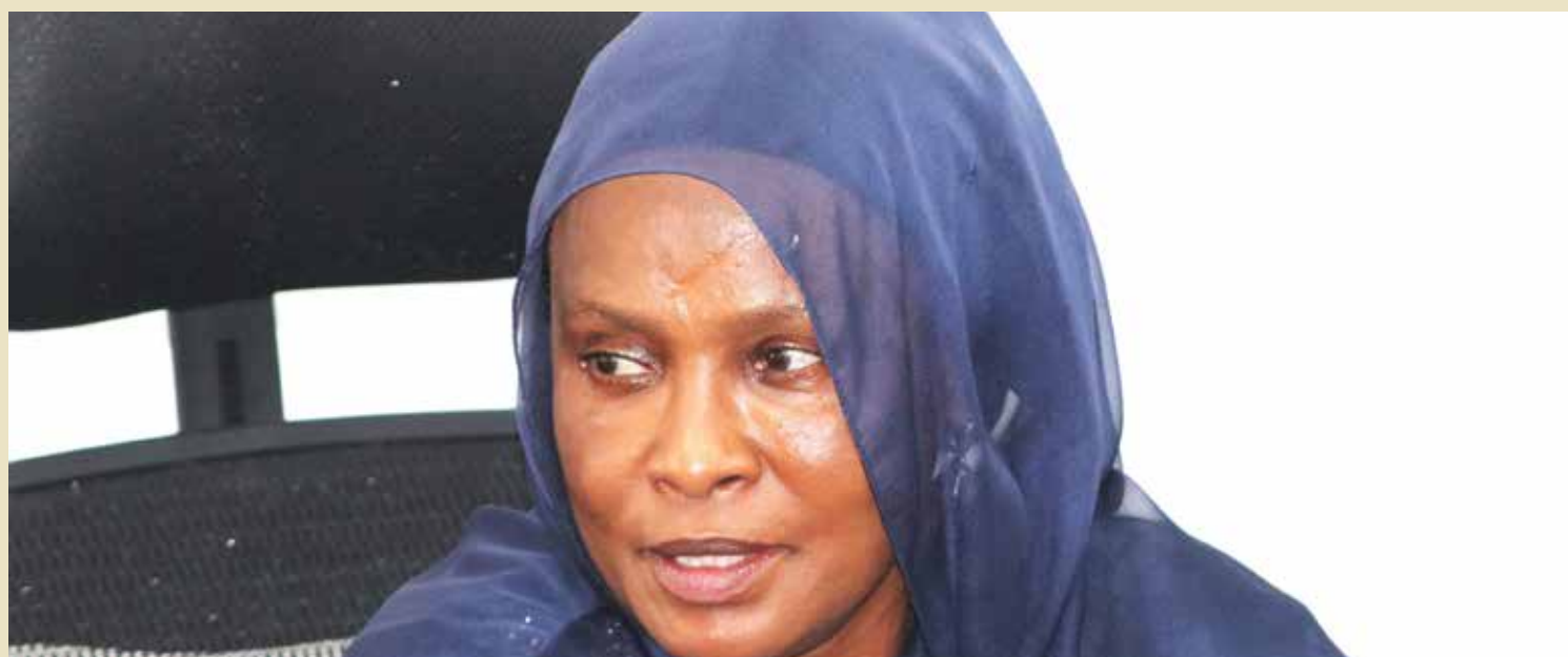
Senator Fatuma Dullo

As a Senator, she is constitutionally tasked with exercising oversight over county government functions to safe-