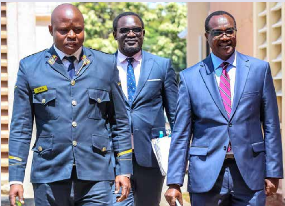
Education Cabinet Secretary Julius Ogamba is escorted out of the Senate Chamber by a Parliamentary staff when he appeared to answer Members' Questions.

The government paid Sh413,000 to each family that lost a learner in the stampede that occurred at the Kakamega Primary in February 2020, the Ministry of Education has