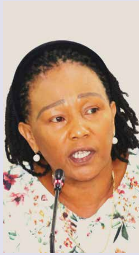
Senator Betty Montett