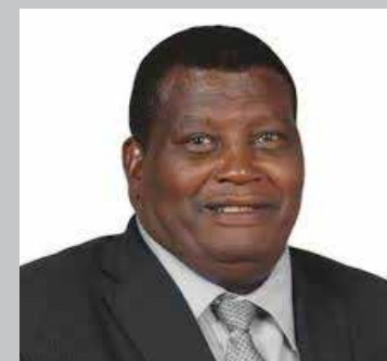
Senator Daniel Karaba said:

“This country has a new Constitution. This country adopted the Constitution after a long process of negotiations. It is unfortunate that we have institutions who still think that the country is still being governed by the old constitution. There are new institutions courtesy of the new Constitution. Previously, we had a unicameral Parliament. Under the new Constitution, we have a bicameral Parliament; that is the Senate and the National Assembly. However, many of our people think Parliament is made up of the National Assembly. It is an unconstitutional for Members from one Chamber to propose amendments to various legislations without, including participation of the other House. Some of the treaties this country has ratified have serious implications with regard to agriculture and health and yet those two functions are fully devolved. There is no way that this country can be treated to a circus where devolved functions like agriculture, health and infrastructure, this country will be committing itself and ratifying some of the treaties within those sectors. The contribution of the Senate must be mainstreamed and must be ensured in these Bills.”