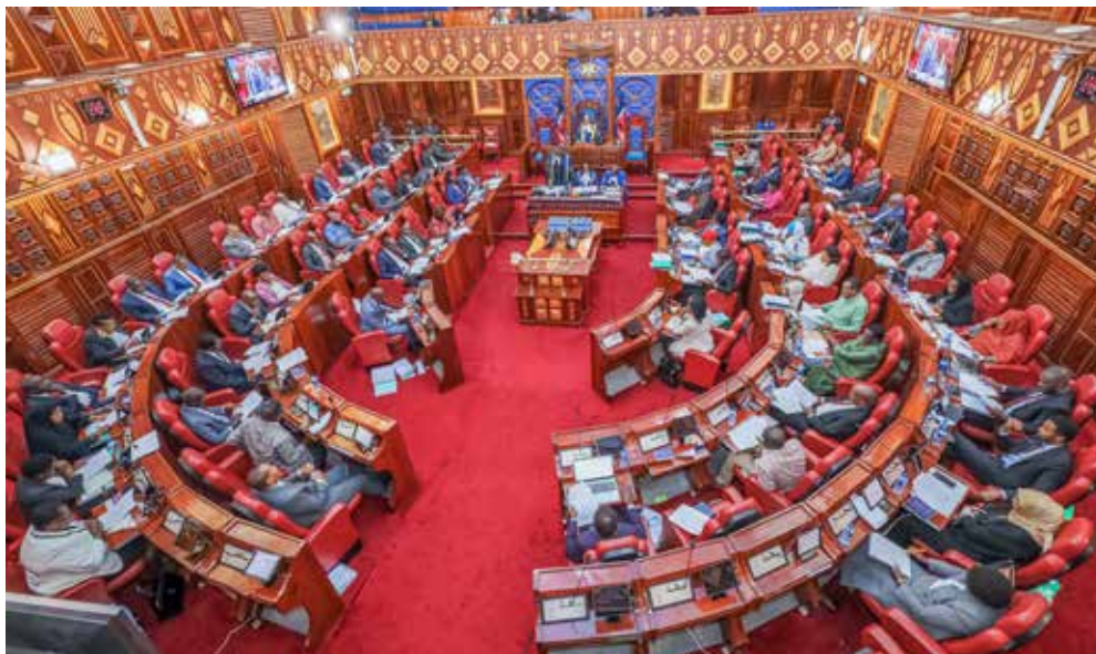
A sitting of the Senate.

Three Committees report to the House steps taken by State agencies to implement resolutions contained in the Motion on Current state of the Nation adopted in July.