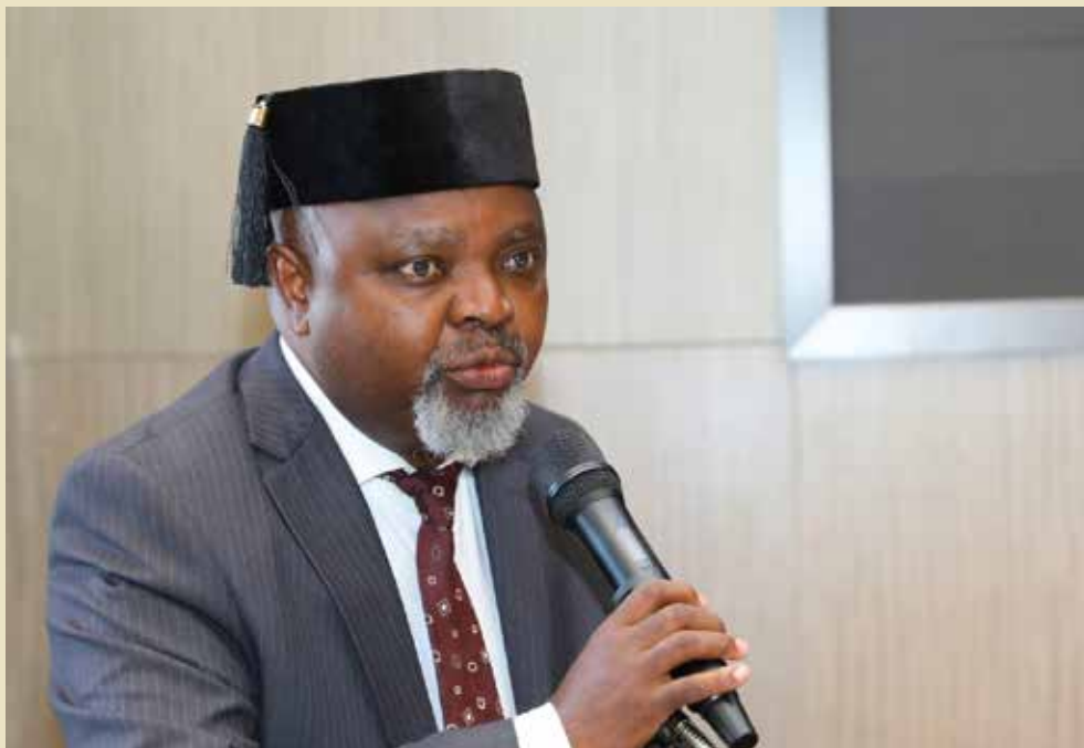
Senator Kathuri Murungi

Senators have called on the National Government to absorb into full employment hundreds of young Kenyans who get a chance to participate in the internship programme of the Public Service Commission (PSC).