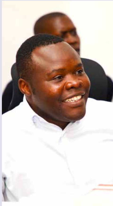
Senator Eddy Oketch