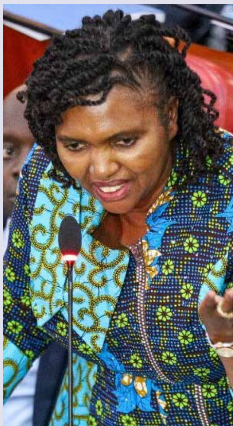
Senator Tabitha Keroche