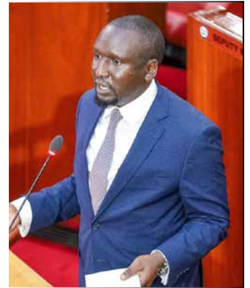
Minority Leader Stewart Madzayo and Majority Leader Aaron Cheruiyot co-sponsored the Motion on the Current State of the Nation.

Three Committees have submitted the progress they have made in the implementation of the Motion adopted by the House last July, focusing on the Current State of the Nation.