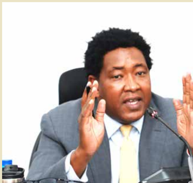
Senator Ledama ole Kina