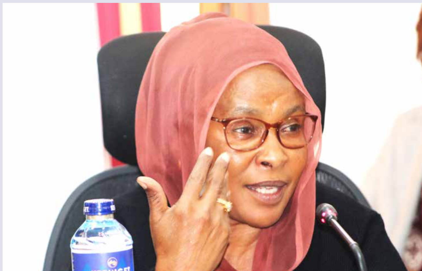
Senator Fatuma Dullo tabled the status report.

During the deliberation, with the officers, the Committee adjourned the