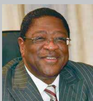
Senator Amos Wako said:

“They deleted the power of the Senate. That is what we are trying to address because the Constitution is very specific that Parliament is made up of both Houses. Such treaties must be considered by both Houses. The amendment is addressing the position that Parliament should have its role in treaty making.