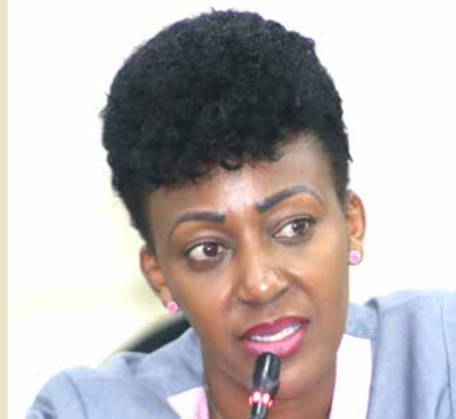
Senator Tabitha Mutinda

The Kenya Bureau of Standards (KeBS) has been directed to ensure that digital products within the Kenyan market are to the required standards.