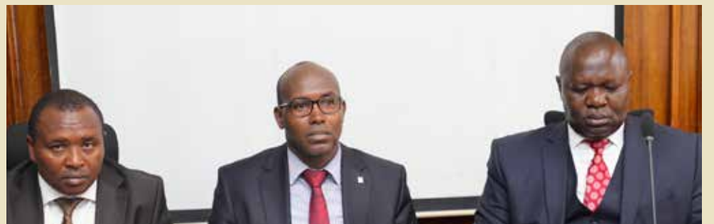
Senator Joseph Githuku, Senator Lelegwe Ltumbesi and Senator Tom Ojienda, who was elected the vice chairperson.

She will be deputised by Senator Ojienda who echoed the call for teamwork. Senator Edwin Sifuna pushed for focus on national security concerns. "As a committee, we should dig deeper into various issues that are under our watch,