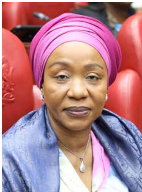
Senator Hamida Kibwana

Senator Hamida Kibwana has hailed the recent High Court ruling which declared Section 226 of the Penal Code unconstitutional, thereby decriminalising attempted suicide in Kenya.