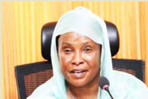
Senator Fatuma Dullo after she was elected chairperson, Committee on National Security.

After her election, Senator Dullo vowed to ensure the Committee delivers on its mandate. "We have had challenges in the past but going forward we shall address various issues touching on foreign relations, issues to do with insecurity, cattle rustling among others," she stated, even as she urged committee members to commit fully to their work, emphasising the importance of collaborative efforts