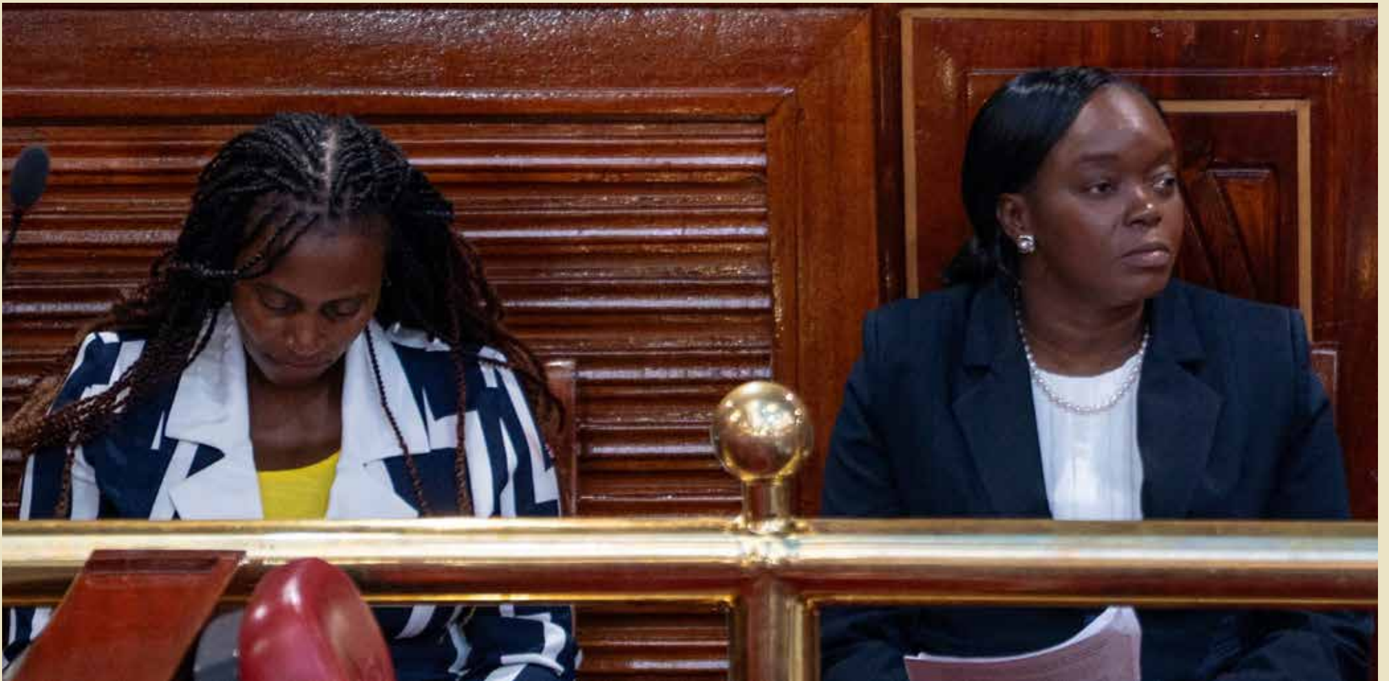
Health CS Deborah Barasa (right) and the PS for Public Health and Professional Standards, Mary Muthoni follow proceedings during last week's Questions and Answers Time.

T he recent withdrawal of funding by the American Government has had profound and far-reaching consequences on several critical health programmes in Kenya, the Government has said.