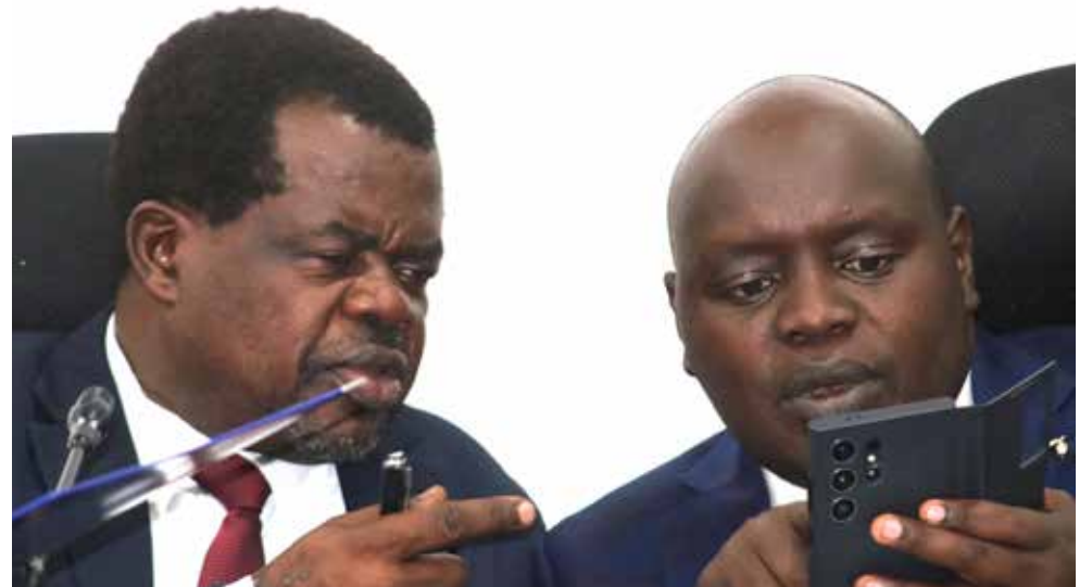
Senator Samson Cherarkey (right) and Senator Okiya Omtatah

The House has asked the Ministry of Sports and Youth Affairs and Nairobi City County to designate land where national heroes will be buried.