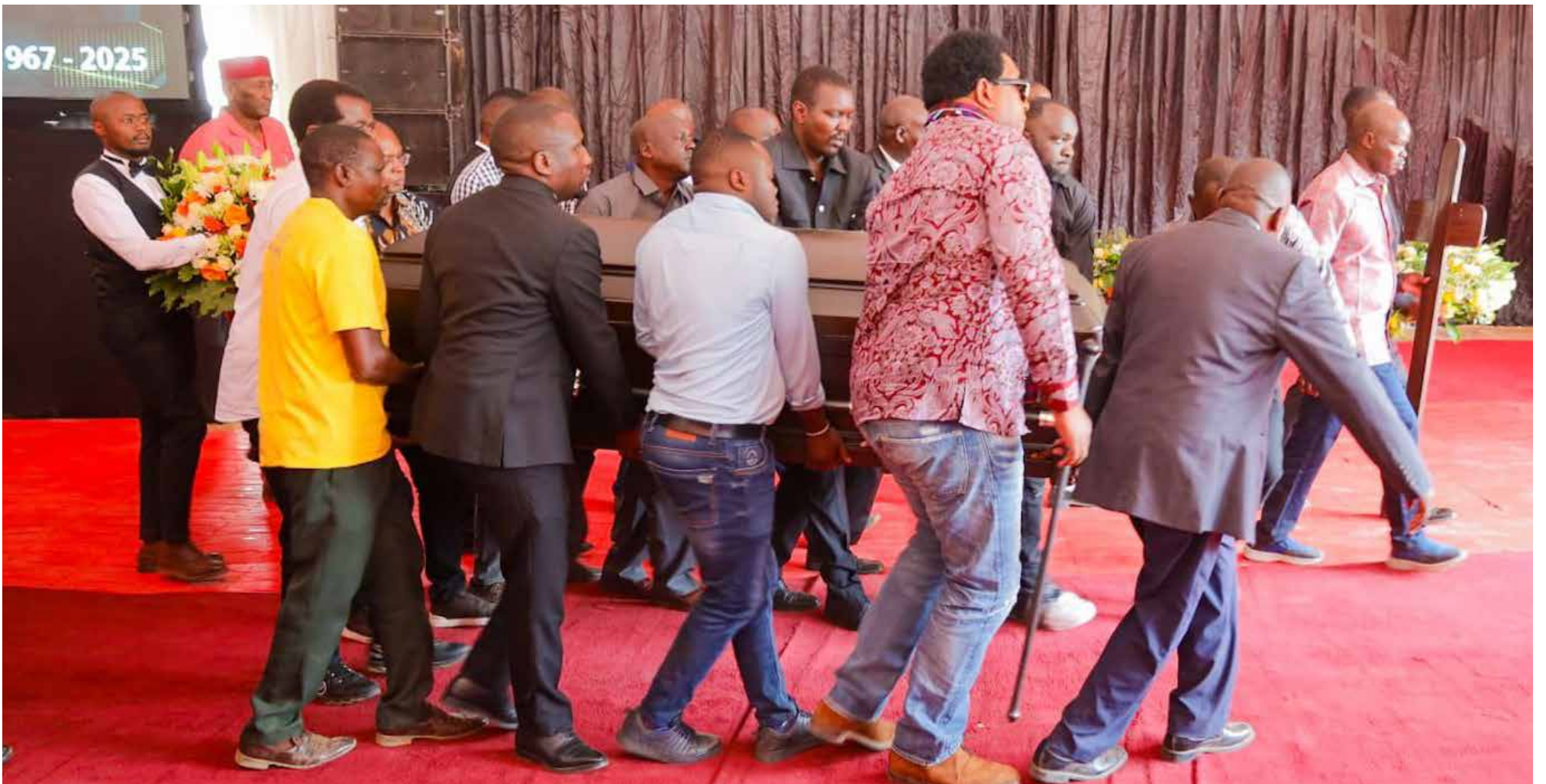
Senators led by Majority Leader Aaron Cheruiyot (in black suit) and Minority Whip Ledama ole Kina carry Senator William Cheptumo's casket to its resting place during the burial ceremony.

Senator William Cheptumo's voice carried the weight of experience, wisdom, and reason, whether on the floor of the House, in Committee deliberations, or during informal engagements.