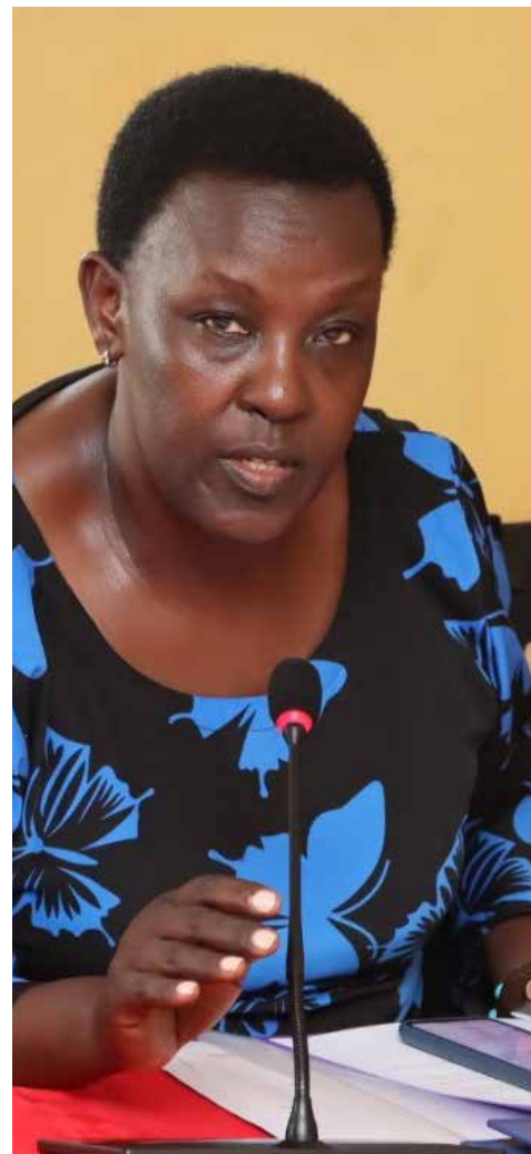
Senator Beatrice Ogola and Senator Danson Mungatana, the sponsor of the Motion.

"On behalf of the people of Mombasa, where he originated from, I convey my sincere condolences to the family, friends, and workmates on the demise of this great person."