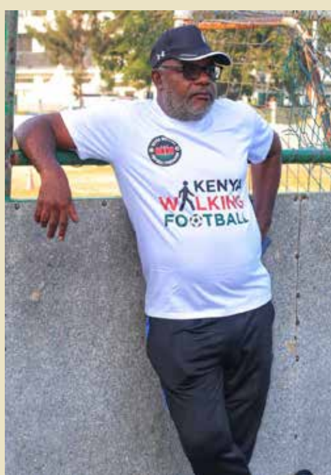
Senator Mohamed Faki follows the training sessions of the Walking Football teams in Mombasa.