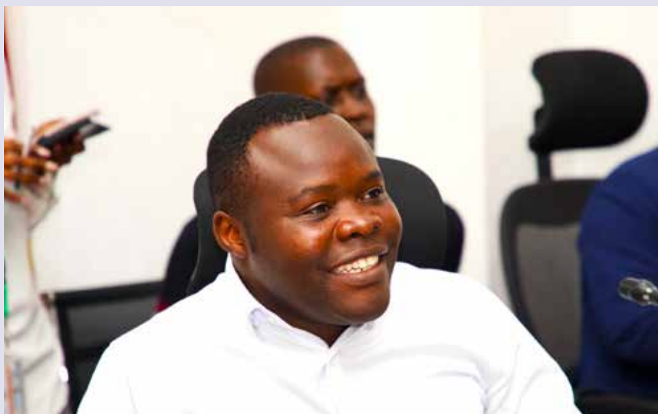
Senator Eddy Oketch

S enator Eddy Oketch has asked the Kenya Agricultural and Livestock Research Organisation (KALRO) to reform its salary processing system to avert persistent salary delay at the institution.