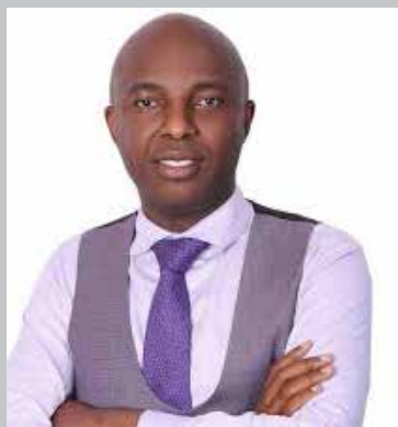
Senator Irungu Kangata

Senator Irungu Kangata presented a Petition on behalf of the residents of Maragwa, Kandara, Kigumo and Gatanga Constituencies over the proposed Mitubiri Sanitary Landfill Project in Muranga County. The project is intended to be a dumping site for waste from the five counties of Nairobi, Kiambu, Kajiado, Murang'a and Machakos. The National Environment Management Authority (NEMA) conducted an Environmental Impact Assessment (EIA), but Murang'a County Government dismissed claims that it was involved in the planning of the project. Area residents have raised concerns that the project may turn the county into a dumpsite and, therefore, affect ground water and pollute the soil. The Petitioners wanted the Senate to intervene and have project halted pending consultations, ensure that a safety audit is undertaken to guide the implementation and the effects of the project and that fresh public participation exercise is conducted to enable residents to understand the implications of the project. “Ninety per cent of the water consumed by the people of Nairobi County comes from Murang'a County. But the ‘thank you’ we get from the people of Nairobi County is giving us their waste. We give them water for free but instead of them thanking us, they are giving us waste. We are very unhappy with this project that intends to bring all the waste— from Dandora dumpsite in Nairobi and Machakos— and relocate it to Murang'a County,” he said.