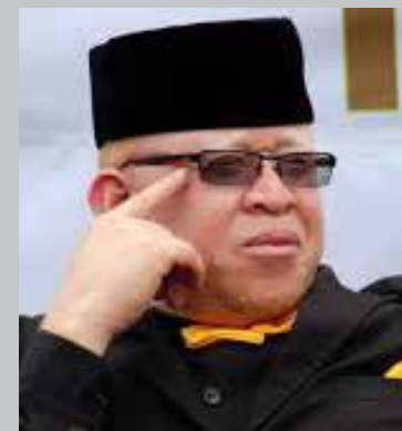
Senator Isaac Mwaura said:

“I would urge the Committee on Land, Environment and Natural Resources to draw heavily from the document of the New Urban Agenda which has been globally debated at various fora of United Nations regarding waste management, disposal and sustainable cities and urban centres and how they need to grow. All our county governors were represented in this global debate. This has come out as a result of a sustainable programme and activities that need to be carried out. I can put to you regarding Nairobi City. In fact, Senator Johnson Sakaja should pick up the proposal by Japan to generate power to the national grid from the Dandora Dumpsite. The major element we need to pick out of this petition is how to handle solid waste, how to segregate the solid waste from the hazardous waste against the innocuous waste which can be turned into manure and other events.”