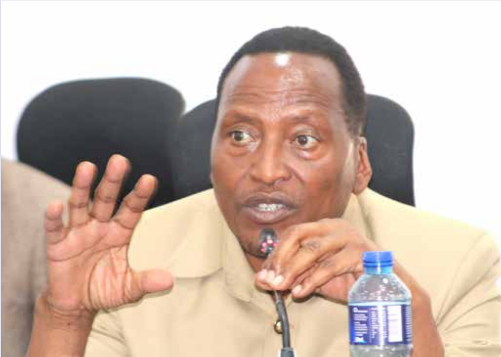
Senator Richard Onyonka

A Senator has given a notice of Motion which seeks to compel the Ministry of Health to establish National Teaching and Referral hospitals in five regions of Kenya - Coast, Eastern, North Eastern, Nyanza and Western – as one of the strategies of improving health care services across the country.