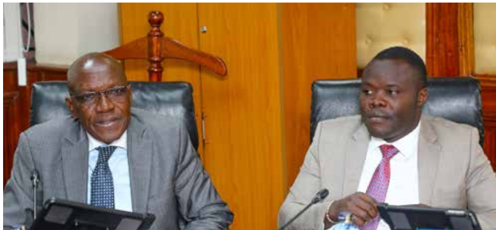
Seneta Eddy Oketch (kulia) na Seneta Boni Khalwale

Seneta Eddy Oketch amelitaka Shirika la Utafiti wa Kilimo na Mifugo nchini Kenya (KALRO) kurekebisha mfumo wake wa usindikaji wa mishahara ili kuhakikisha malipo ya mishahara.