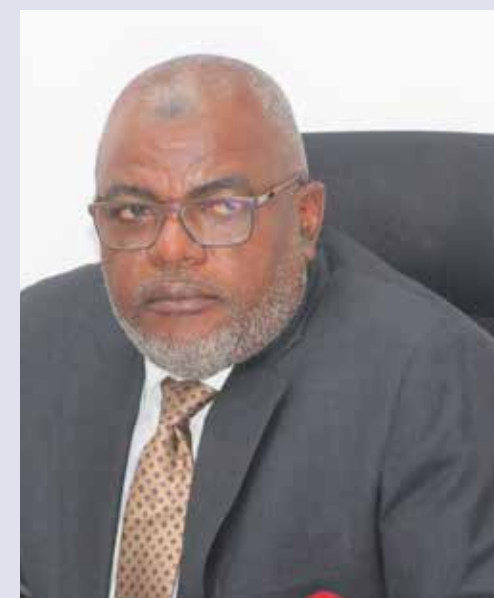
Senator Mohamed Faki

He also wants to know whether the Data Protection Commissioner has initiated enforcement actions in response to the data breach, and if so, outline the recommendations that have been made to improve data security.